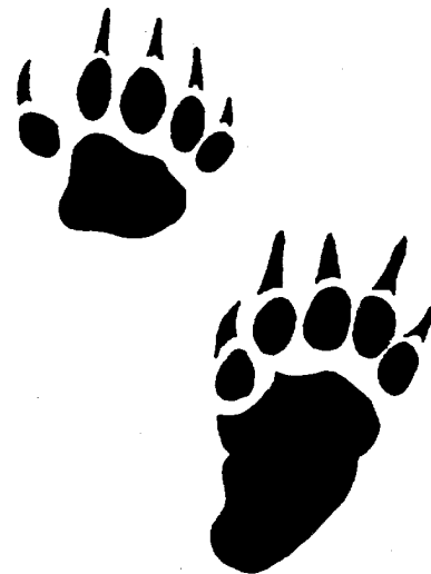
Figure 2. Skunk tracks.

Preventive measures can be taken to keep skunks from denning under buildings by sealing all openings under the foundation. Cover all openings with wire mesh,