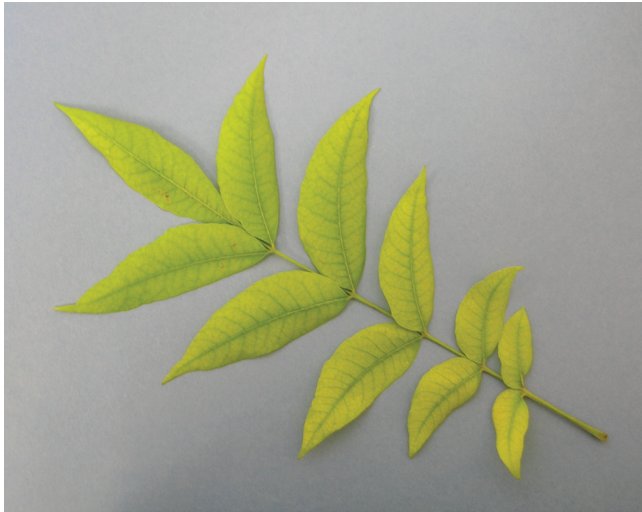
Figure 5. Pecan leaf with severe interveinal chlorosis typical of iron deficiency.