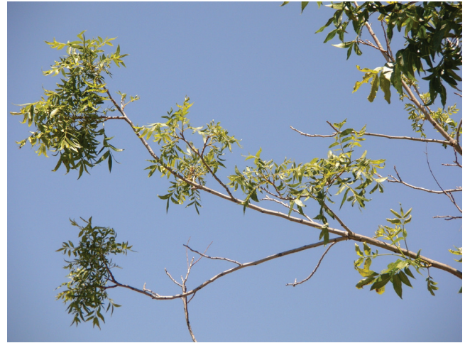
Figure 4. Pecan leaves showing signs of zinc deficiency.

orchards require foliar applications of Zn during the early part of each season while leaf expansion and shoot growth are underway. Orchards with coarse-textured soil (sand or sandy loam) are especially prone to Zn deficiencies. Zinc is poorly mobile within the pecan tree, so good Zn spray coverage in the canopy is critical, and repeated applications (3–5 for mature orchards, 5–8 for immature orchards) are usually necessary. ‘Wichita’ cultivar pecan trees are far more prone to Zn deficiency than other popular New Mexico cultivars such as ‘Western’ (‘Western Schley’). Zinc is an important component or activator of numerous plant proteins, including proteins involved in DNA synthesis, photosynthesis, and root tolerance of flooded soils. Adequate Zn nutrition is necessary for normal metabolism of the auxin hormone indoleacetic acid (IAA), which regulates shoot and leaf growth patterns among many other things. The usual visible symptoms of Zn deficiency are shortened internodes (the part of the stem between leaf nodes) and small leaves with interveinal chlorosis and rippled leaf margins (Figures 3 and 4). This suite of symptoms is called “rosette” and “little leaf.” In severely Zn-deficient trees, interveinal necrosis and shoot dieback eventually become evident. Oftentimes, the symptom form and severity in Zn-deficient pecan orchards vary greatly among trees and even among branches within the same tree canopy. Zinc deficiency greatly inhibits growth and development