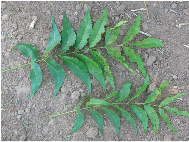
Figure 3. Pecan leaves showing rippled leaf margins characteristic of zinc deficiency.

orchards require foliar applications of Zn during the early part of each season while leaf expansion and shoot growth are underway. Orchards with coarse-textured soil (sand or sandy loam) are especially prone to Zn deficiencies. Zinc is poorly mobile within the pecan tree, so good Zn spray coverage in the canopy is critical, and repeated applications (3–5 for mature orchards, 5–8 for immature orchards) are usually necessary. ‘Wichita’ cultivar pecan trees are far more prone to Zn deficiency than other popular New Mexico cultivars such as ‘Western’ (‘Western Schley’). Zinc is an important component or activator of numerous plant proteins, including proteins involved in DNA synthesis, photosynthesis, and root tolerance of flooded soils. Adequate Zn nutrition is necessary for normal metabolism of the auxin hormone indoleacetic acid (IAA), which regulates shoot and leaf growth patterns among many other things. The usual visible symptoms of Zn deficiency are shortened internodes (the part of the stem between leaf nodes) and small leaves with interveinal chlorosis and rippled leaf margins (Figures 3 and 4). This suite of symptoms is called “rosette” and “little leaf.” In severely Zn-deficient trees, interveinal necrosis and shoot dieback eventually become evident. Oftentimes, the symptom form and severity in Zn-deficient pecan orchards vary greatly among trees and even among branches within the same tree canopy. Zinc deficiency greatly inhibits growth and development