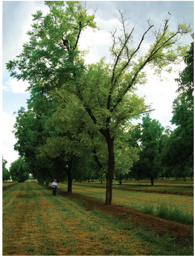
Figure 6. Pecan tree that has experienced branch and limb dieback due to iron deficiency.

Copper (Cu). Copper, like many of the other micronutrients, activates or is contained in many different enzymes and proteins, including several involved in photosynthesis and cellular respiration. Copper deficiency is not well described in pecan, but Cu is similar to other previously discussed metal micronutrients in that it is poorly available for root uptake from alkaline and calcareous soils. Recommended leaf Cu concentration in July to August is 8 to 30 ppm.