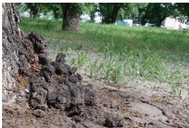
Figure 10. Crown gall on trunk of a pecan tree.