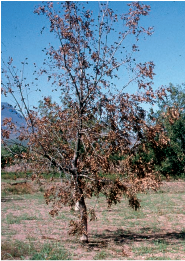
Figure 1. Pecan tree killed by Phymatotrichopsis omnivora .