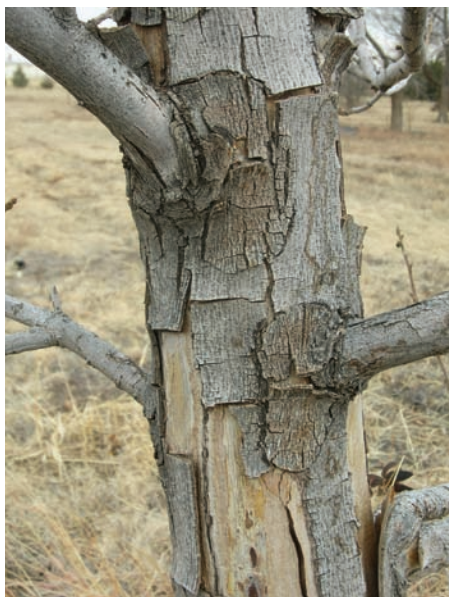
Figure 25a. Southwest injury.