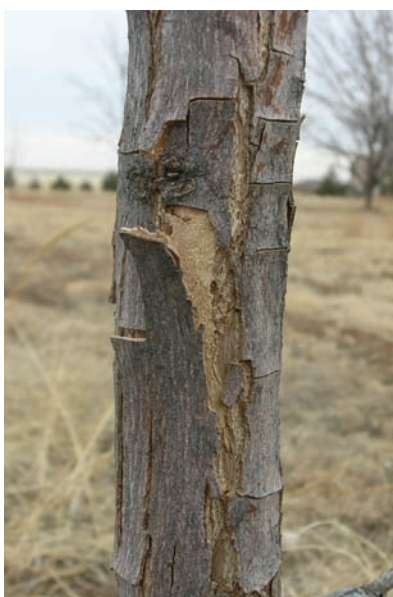
Figure 25b. Southwest injury.