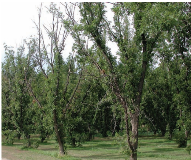
Figure 11. Dieback and tree decline caused by root-knot nematode.

moderate to severe root damage resulting in dieback of young branches and tree decline. Damage is worse in years following heavy nut production (Figure 11). Mouse ear (see Mouse Ear section) symptoms may also be observed due to nickel deficiency caused by disrupted nutrient uptake in nematode-damaged roots. Careful examination of feeder roots from infected trees will show small knots or galls produced by pecan root-knot nematodes (Figure 12).