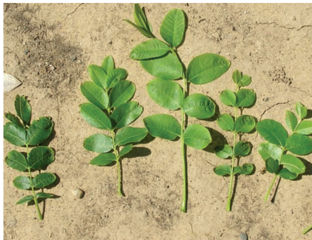
Figure 20. Mouse ear caused by nickel deficiency.

which nutrient is deficient. Additionally, chlorosis may be a symptom of black aphid feeding injury or accidental exposure of pecan trees to certain herbicides (see Black Pecan Aphid and Herbicide Injury sections).