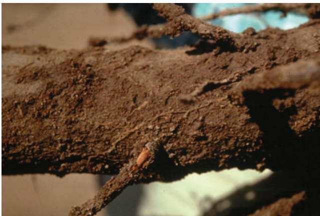
Figure 3. Fungal strand of Phymatotrichopsis omnivora on a pecan root.