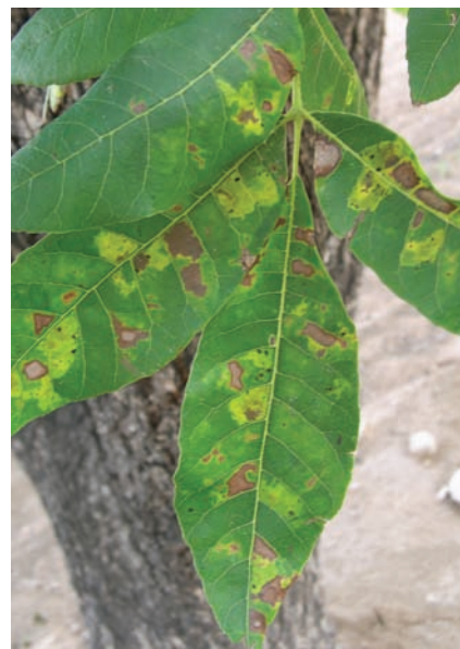
Figure 26. Symptoms caused by black pecan aphid feeding.