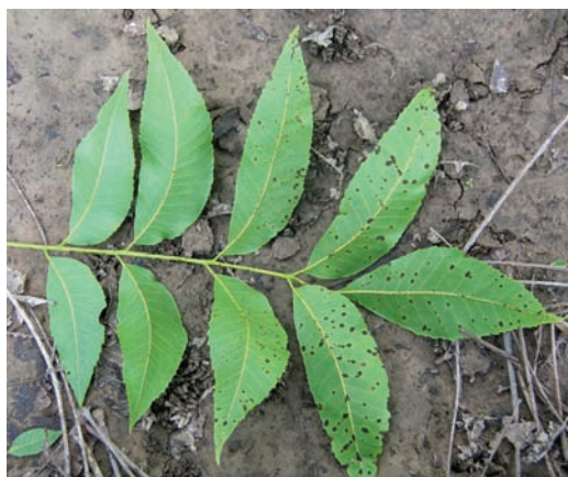
Figure 13. Early scab infection on pecan foliage.