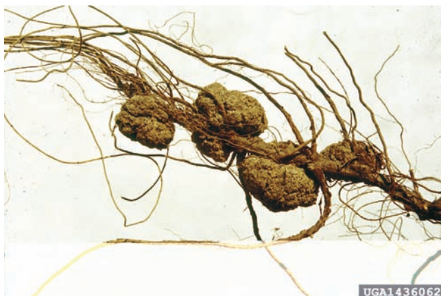
Figure 9. Crown gall on pecan roots (Clemson University, USDA Cooperative Extension Slide Series, Bugwood.org).