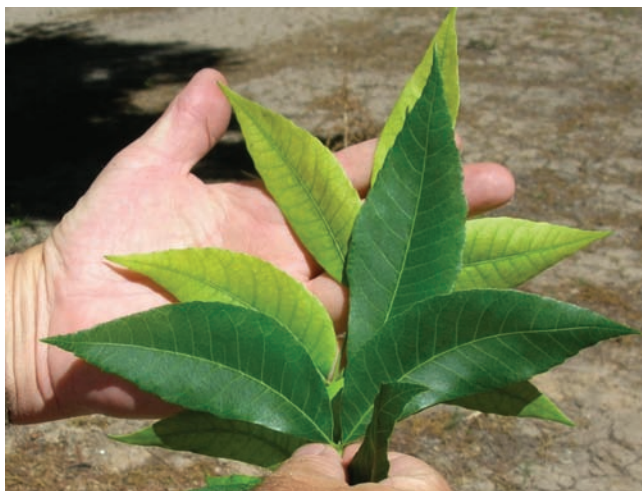
Figure 17. Healthy leaf (on top) and leaf exhibiting interveinal chlorosis (beneath) caused by iron deficiency.