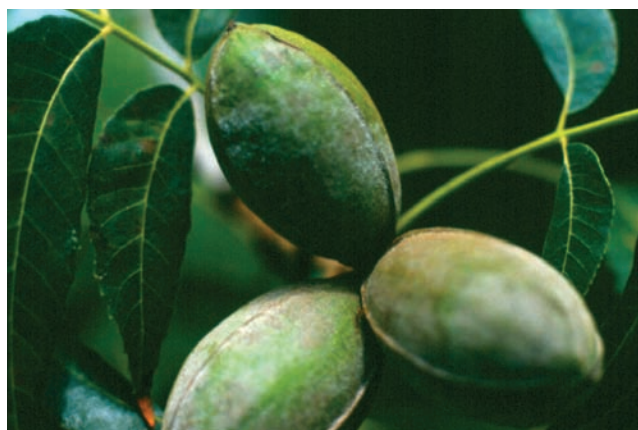
Figure 6. Powdery mildew on pecan nuts.

This fungal disease, caused by Microsphaera penicillata , is of minor importance in New Mexico, but pecan trees may occasionally be affected following periods of high humidity and cool summer nights where airflow through the canopy is restricted. The fungus forms a white powdery growth on the nuts (Figure 6) and in some cases may be found on the leaves (Figure 7). The white powdery fungus may disappear later, but affected nuts will have a brown russet appearance (Figure 8). Nuts may be small and not reach their full size when they are infected early in the growing season, or the shucks may split prematurely and kernels may be shriveled.