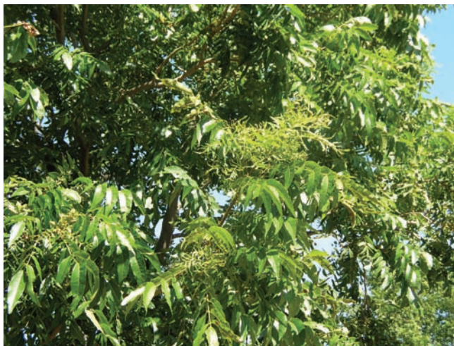
Figure 19. Rosette and little leaf caused by zinc deficiency.