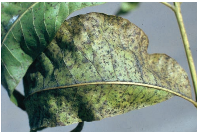
Figure 27. Sooty mold.

amount of light reaching the leaf surface, thus reducing the production of carbohydrates in the tree. Controlling aphids and other honeydew-producing insects should help to control sooty mold.