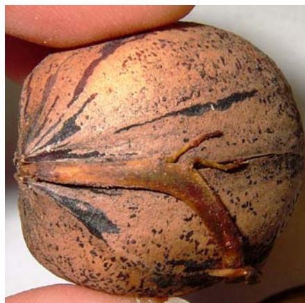
Figure 24. Premature germination.

Occasionally, pecan trees may be injured by cold temperatures, even in southern New Mexico pecan growing areas. Late spring and early fall freezes injure or kill actively growing tissues, including shoots, leaves, flowers,