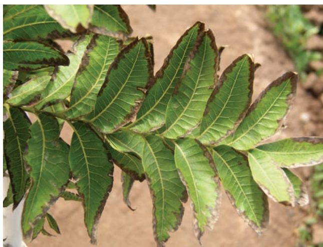
Figure 21. Marginal leaf burn caused by excessive soil salt levels.