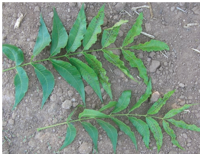
Figure 18. Little leaf symptom caused by zinc deficiency.