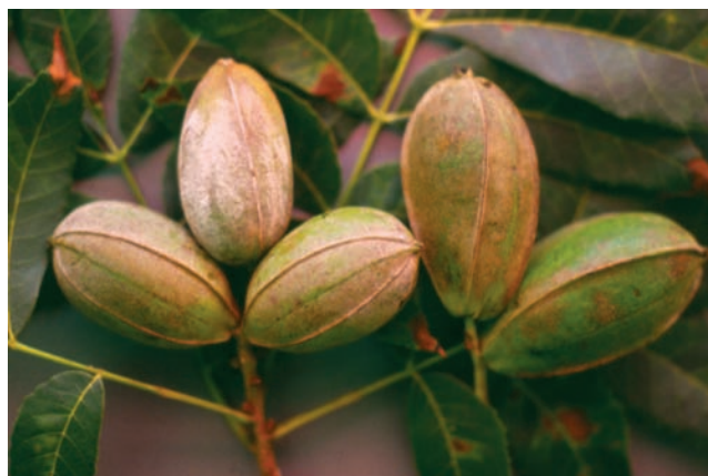
Figure 8. Russet appearance on pecan nuts from infection by powdery mildew.