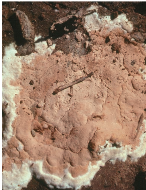
Figure 5. Spore mat of Phymatotrichopsis omnivora .