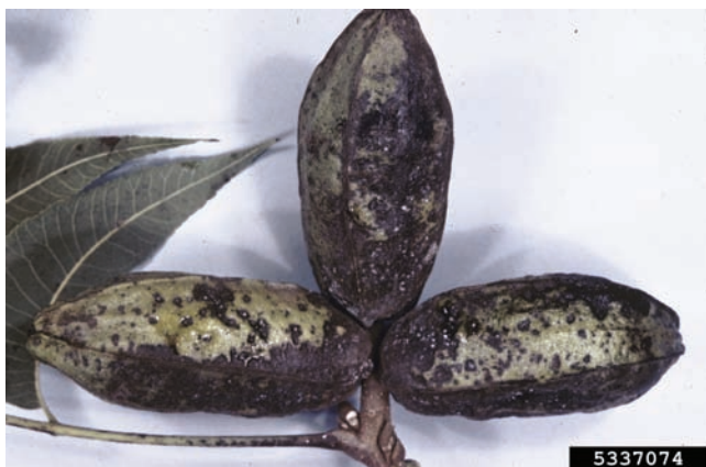
Figure 15. Severe scab infection on pecan shucks (Charles Drake, Virginia Polytechnic Institute and State University, Bugwood.org).