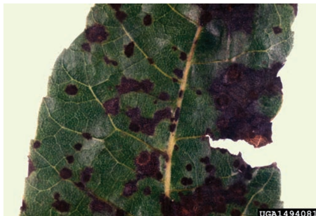
Figure 14. Advanced scab infection on pecan leaf (University of Georgia Plant Pathology Archive, University of Georgia, Bugwood.org).