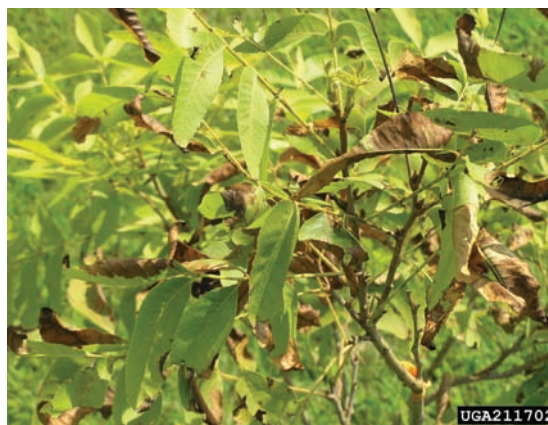
Figure 16. Pecan bacterial leaf scorch.

Iron deficiency differs from N deficiency in that the yellowing occurs primarily between the leaf veins, with the veins retaining a green color (“interveinal chlorosis”; Figure 17). Leaves with severe Fe chlorosis may be very light, almost white, in color. Iron chlorosis is most prevalent in pecan orchards with very high soil bicarbonate levels or poorly drained, waterlogged soils. Often, within affected pecan orchards, only a few scattered trees will display Fe deficiency symptoms, and on affected trees the severity of Fe chlorosis typically varies dramatically among branches in the same canopy. Iron