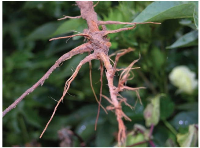
Figure 2. Root rot caused by Phymatotrichopsis omnivora .