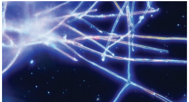
Figure 4. Microscopic cruciform hyphae unique to Phymatotrichopsis omnivora .