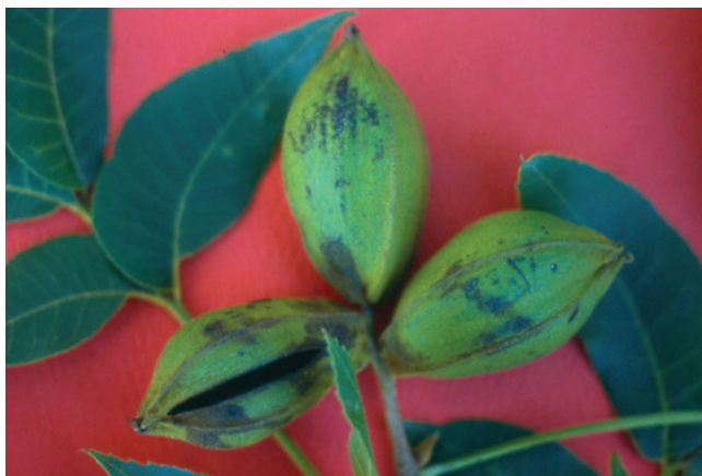
Figure 23. Lengthwise splits resulting from periods of heavy rain and high humidity (a disorder known as water stage fruit split).