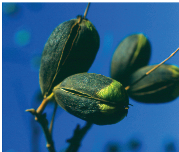
Figure 22. Shuck necrosis.

If laboratory soil analyses indicate that salinity problems are developing in an existing orchard, the only way to reduce soil salts is by supplying excess water above the tree irrigation requirement (i.e., a “leaching fraction”) to leach salts below the trees’ rootzone. The amount of water required to adequately leach the salts out of a saline soil depends on the levels of salts in both the soil and the water. Amendments such as gypsum, sulfuric acid, and elemental sulfur can be applied to soils with high