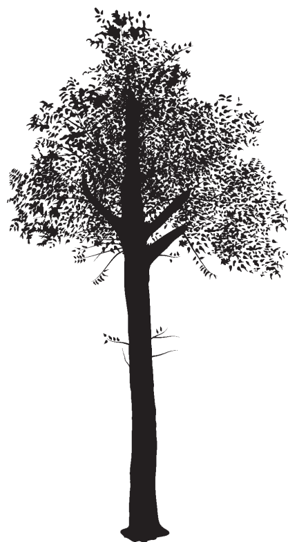
Figure 1. Mature pecan tree with scaffold limbs in its first growing season after transplant.

Pruning is a key factor in minimizing transplant shock. Before transplanting, commercial pecan growers