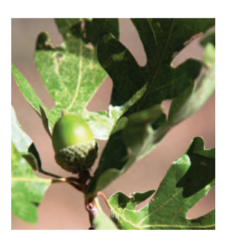
Figure 40B. Gambel oak (Quercus gambelii).

LIVESTOCK AFFECTED: Oaks have caused extensive losses of cattle, horses, sheep, and goats.