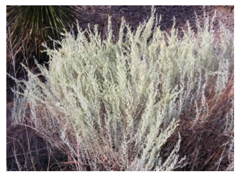
Figure 50. Sand sagebrush (Artemisia filifolia).

DESCRIPTION: Sand sagebrush ( Artemisia filifolia ) is a perennial shrub up to 4 feet tall; stems and leaves are covered with gray hairs, which give the plant a silvery appearance; leaves are 3–4 inches long and divided linearly into filiform segments; flowers are small and borne at the end of the stems.