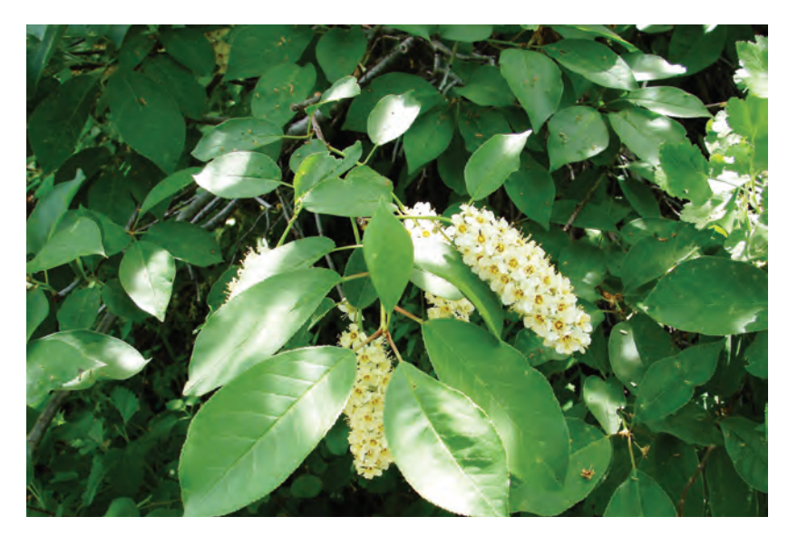
Figure 11. Chokecherrry (Prunus virginiana).

DESCRIPTION: Large, erect shrub or tree up to 20 feet tall; young twigs are red to brown and covered with light-colored dots (lenticels); leaves are dark green, 2–4 inches long, and 1–2 inches wide, usually oval with a pointed tip, rounded base, and saw-toothed margins; flowers are small and yellow-white, occurring in dense clusters as a cylindrical raceme; fruit is dark red to black, about 0.4 inch in diameter. Other members of the genus known to be toxic include pin cherry ( P. pensylvanica ) and wild black cherry ( P. serotina ).