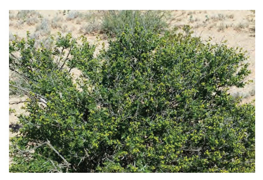
Figure 60B. Tarbush (Flourensia cernua).

tarbush. The buds, heads, green achenes, and especially the mature achenes are the main problems. About 1% of the animal's body weight in tarbush fruits is toxic. There is considerable variation in individual susceptibility, and only a small margin exists between toxic and lethal doses. The specific toxin is unknown, although there is a high concentration of polyphenolics, including phenolics and condensed tannins.