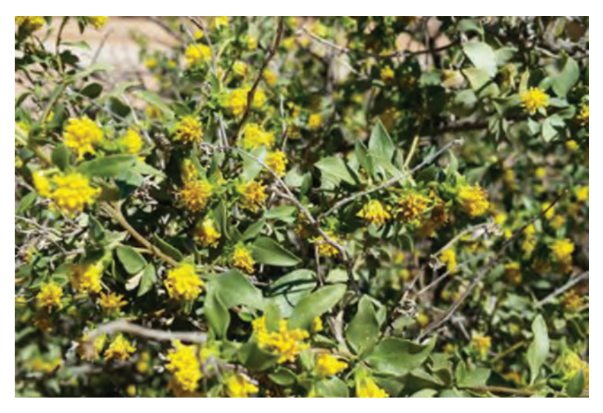
Figure 60A. Tarbush (Flourensia cernua).

Sunflower family (Asteraceae) (Figures 60A and 60B)