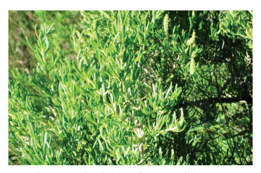
Figure 24A. Greasewood or chico (Sarcobatus vermiculatus).

Goosefoot family (Chenopodiaceae) (Figures 24A and 24B)