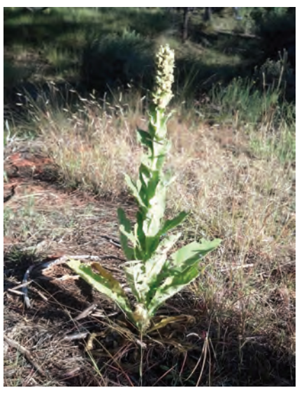
Figure 16. Dock (Rumex crispus).

POISONOUS PRINCIPLE AND TOXICITY: Oxalic acid concentrations of 6–11% have been measured. The concentration of soluble oxalates increases as the plant matures. Rumen microflora can become adapted to low levels of oxalates over a period of several days.