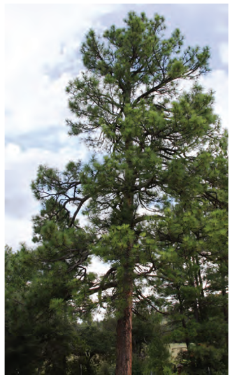
Figure 45. Ponderosa pine (Pinus ponderosa).

POISONOUS PRINCIPLE AND TOXICITY: The specific cause of the abortions in cattle is apparently due to isocupressic acid. Other compounds present in the needles and bark include diterpene abietane acids, which are also toxic to cattle and are possibly responsible for the kidney and brain degeneration in affected cattle. Isocupressic acid causes a marked decrease in uterine blood flow as a result of vasoconstriction. This results in a decrease in progesterone as a result of necrosis of the corpus luteum.