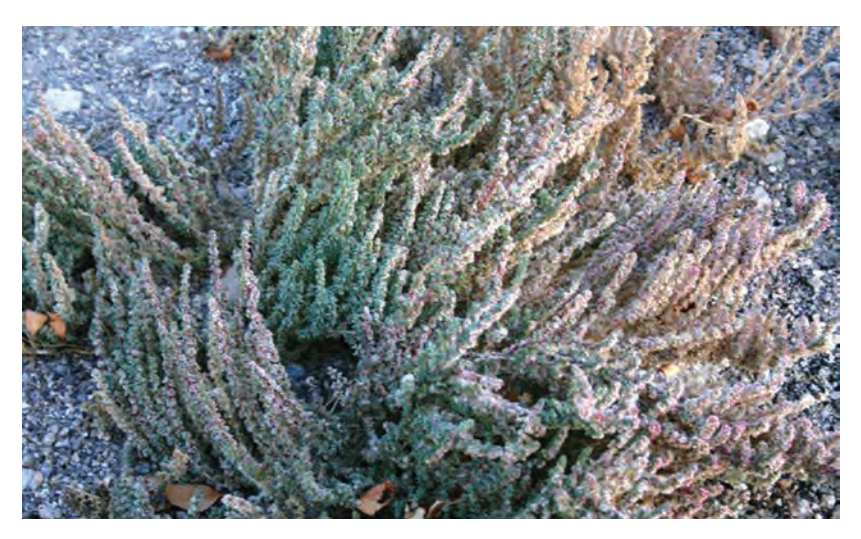
Figure 26B. Halogeton (Halogeton glomeratus).

LIVESTOCK AFFECTED: Sheep, and less frequently cattle.