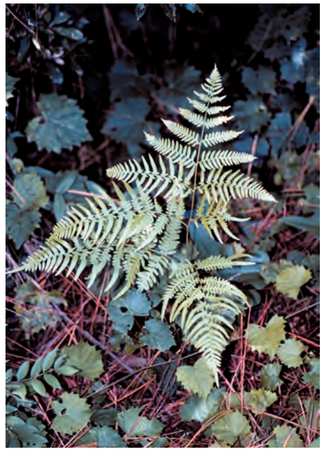
Figure 7. Bracken fern (Pteridium aquilinum).

DESCRIPTION: Large, coarse, perennial forb originating from stout, black, horizontal root stalks often more than 3 feet long; leaves are scattered, 1–4 feet long, 0.5–2 feet wide, borne on terminating erect, rigid, straw-colored stalks that are 1-3 feet tall; leaves are broadly triangular in outline, divided into three main parts, each part subdivided, the ultimate segments oblong, the upper undivided, and the lower lobed; fruiting bodies appear as small circular dots on the underside of mature. leaves.