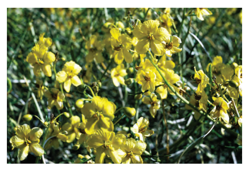
Figure 64. Wooly paperflower (Psilostrophe tagetina).

Sunflower family (Asteraceae) (Figure 64)