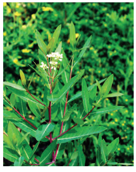
Figure 17. Dogbane (Apocynum sp.).

(A. cannabinum) is found throughout the United States; in New Mexico it is found in moist soils along ditches and waterways and in irrigated fields. Dogbane is common in older hay fields and can be incorporat-