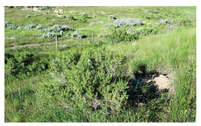
Figure 24B. Greasewood or chico (Sarcobatus vermiculatus).

SIGNS OF POISONING: Dullness, depression, loss of appetite, lowering of head, reluctance to follow band, weakness, irregular gait, prostration, weak respiration and heartbeat, and coma followed by death. Signs appear within 3–5 hours after consuming a lethal dose, followed by death within 12–20 hours after consumption.