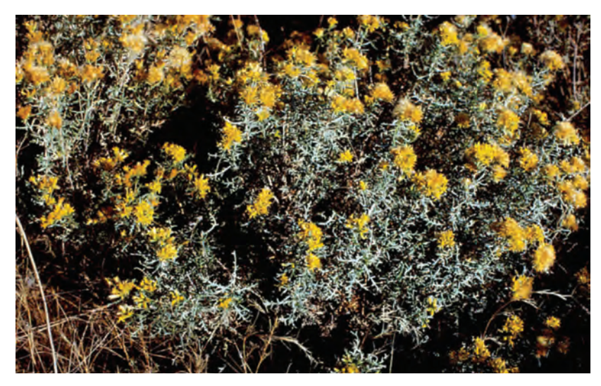
Figure 9A. Burroweed (Isocoma tenuisecta).

DESCRIPTION: Semi-woody half-shrubs; rayless goldenrod/Jimmy-weed will grow up to 4 feet tall; burroweed grows 1–2 feet tall; leaves are alternate, narrow, and divided into linear lobes, and are resinous and sticky; the yellow flowers are borne in flat-topped clusters; mature flowers produce a crop of seeds with numerous short bristles.