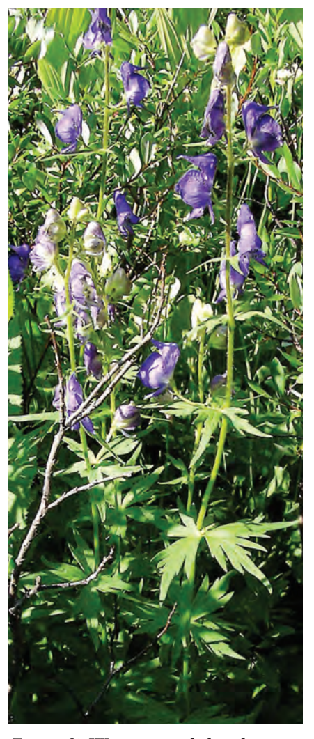
Figure 63. Western monkshood (Aconitum columbianum).

hypaconitine, all of which are highly toxic. All parts of the plant are toxic, with the roots, new leaves, and seeds being especially toxic. Lethal