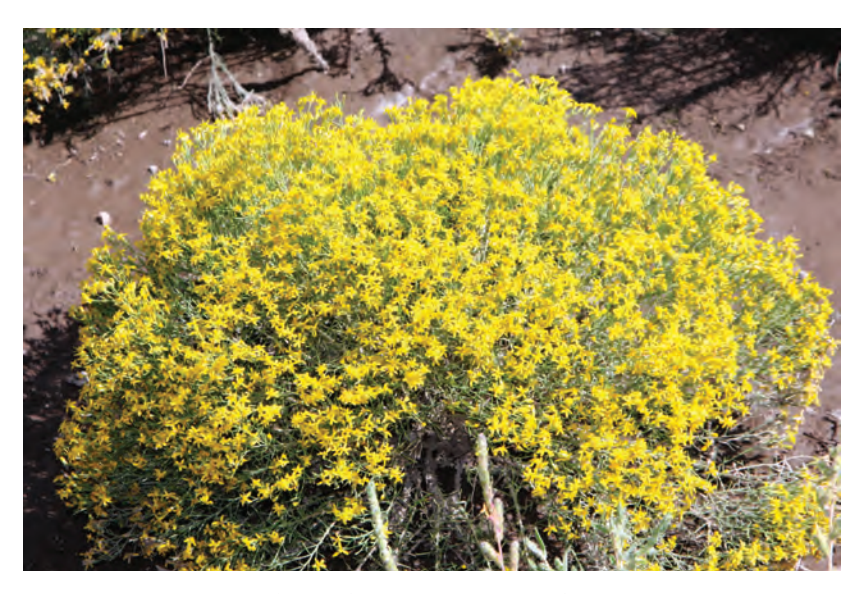
Figure 54A. Broom snakeweed (Gutierrezia sarothrae).

DESCRIPTION: Low, perennial half-shrub growing 1–2 feet tall; many branched and quite resinous; leaves are linear, entire, and alternately arranged; the yellow flowers occur in small composite heads, and the heads usually occur in small clusters at the tips of the numerous branches.