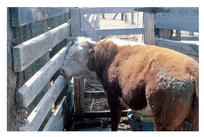
Figure 59B. Hereford bull with blindness caused by tansy mustard poisoning.

play a role, but the symptoms are not entirely consistent with polioencephalomalacia (PEM).