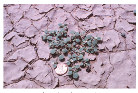
Figure 28A. Inkweed or drymary (Drymaria pachyphylla).

Inkweed, also known as drymary, is a succulent, grayish-green annual forb that lies prostrate against the ground, radiating from a single root and re-branching, forming a plant up to 1 foot in diameter; leaves are paired and opposite, ovate, less than 0.5 inch long by