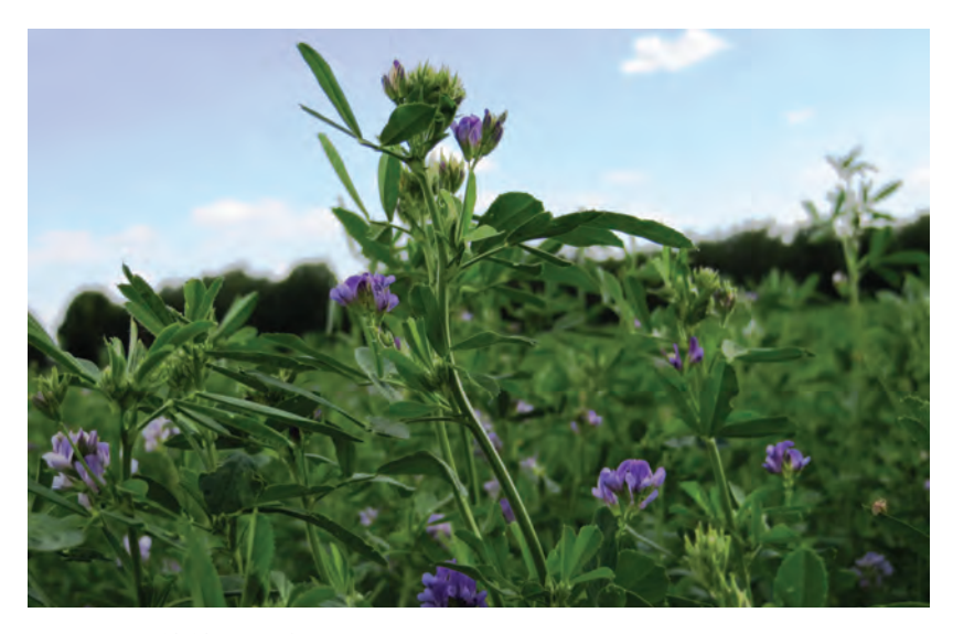
Figure 2. Alfalfa (Medicago sativa).

DESCRIPTION: Perennial, herbaceous flowering plant with deep taproot; stems are 18–36 inches long; leaves are pinnately compound with 3 leaflets; flowers are small with 5 petals, and usually blue to purple in color.