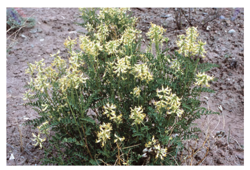
Figure 35A. Stinking vetch (Astragalus praelongus).

the level of selenium concentration in the plant, the amount ingested, and the time over which the poisoning takes place. The first type of poisoning is acute, while the latter two are more or less chronic.