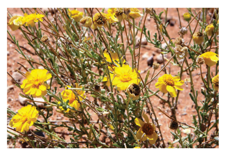
Figure 15. Desert Baileya (Baileya multiradiata).

Sunflower family (Asteraceae) (Figure 15)