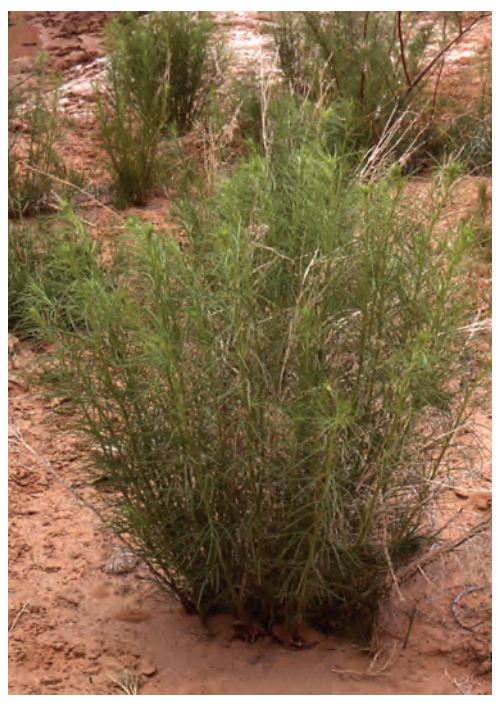
Figure 13. Copperweed (Oxytenia acerosa).

Slender-stemmed erect perennial 3–6 feet tall, somewhat woody at the base, with narrow, threadlike leaves; flowers, borne in July-September, occur in dense panicles with many white discoid heads; 10-20 inner flowers are sterile and staminate, with white corollas and distinct anthers; the plant also has about 5 outer flowers without corollas; erect green to gravish stems have alternate leaves, often entire on the upper portion of the stem, with lower leaves pinnately parted into 3-5 long filiform lobes.