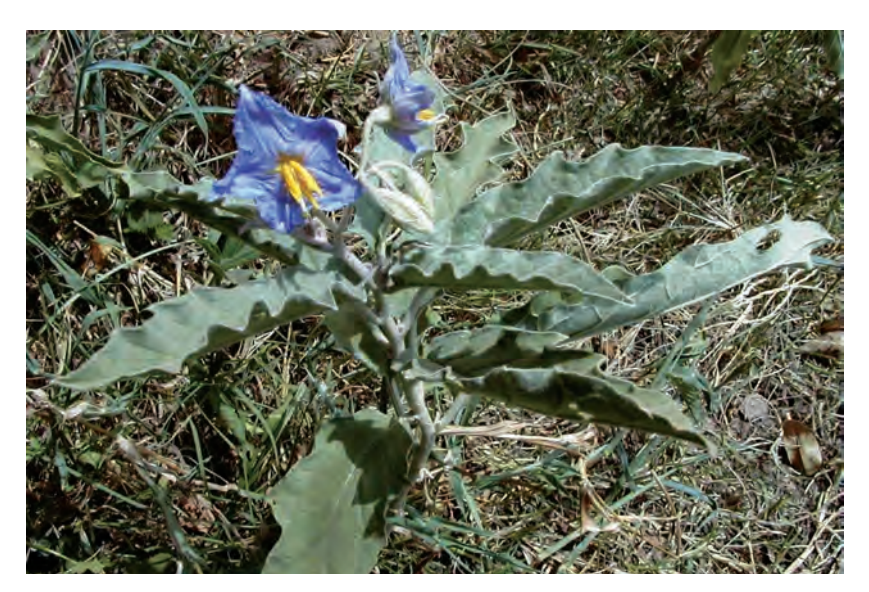
Figure 51. Silverleaf nightshade (Solanum elaeagnifolium).

Nightshade family (Solanaceae) (Figure 51)