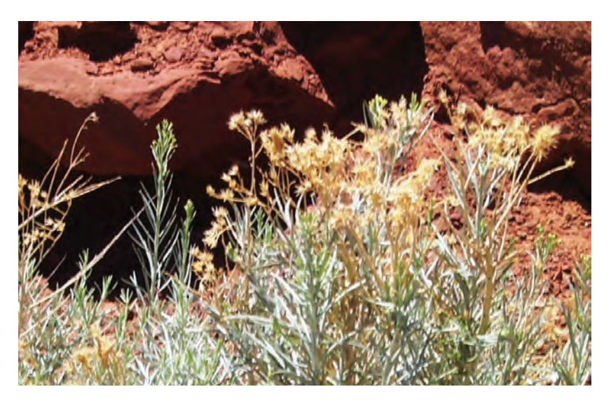
Figure 23B. Gray horsebush (Tetradymia canescens).

These signs appear within 24 hours after ingestion. Many ewes abort and become sterile after eating a sub-lethal dose.