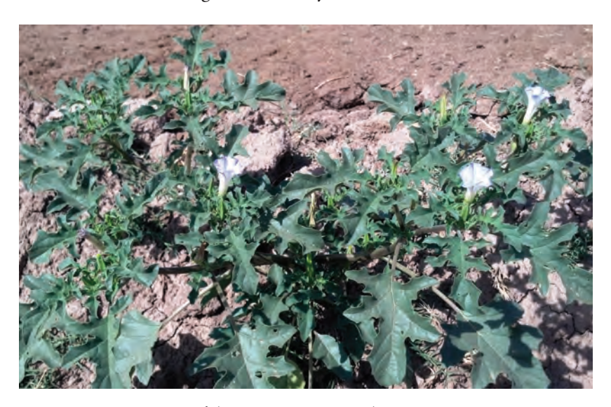
Figure 30A. Jimson weed (Datura stramonium).

DESCRIPTION: Also known as thorn apples, these plants are large, coarse forbs with stout stems and malodorous herbage. Jimson weed ( Datura stramonium ) is an annual forb, whereas sacred datura ( D. inoxia ) is a perennial half-shrub. Leaves are large and oval with wavy to pinnately lobed margins; flowers are large, showy, tubular, white to purple, and fragrant; fruit is an oval or round, nodding or erect, prickly capsule.