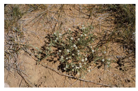
Figure 28B. Alfombrilla (Drymaria arenariodes).

weight is uniformly lethal to cattle and sheep. The toxic compound in inkweed appears to be saponins found in all parts of the plant. The exact structures of the six isolated saponins are not known, but they are likely to be glycosides of githagenin.