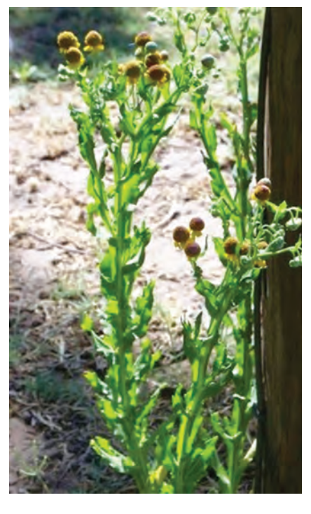
Figure 55. Small-head sneezeweed (Helenium microcephalum).

POISONOUS PRINCIPLE AND TOXICITY: Sneezeweeds contain sesquiterpene lactones, which irritate the nose and gastrointestinal tract. Hymenovin is the primary toxin involved. In addition to the irritant effects, the lactones have a profound effect on metabolism via their ability to bind with sulfhydryl groups. Small-head sneezeweed ( H. microcephalum ) is the most toxic; a dose of 0.125% body weight of green stems and leaves causes illness, and a dose of 0.25% is lethal.