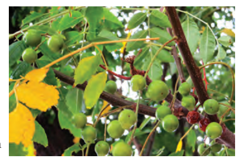
Figure 10. Chinaberry (Melia azedarach).

DESCRIPTION: Deciduous tree up to 50 feet tall with a stout trunk and spreading round crown; bark is usually dark with a furrowed