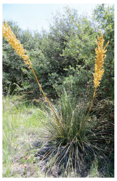
Figure 49. Sacahuista or bear grass (Nolina sp.).

LIVESTOCK AFFECTED: Cattle, sheep, and goats may be poisoned, but sheep and goats are most susceptible.