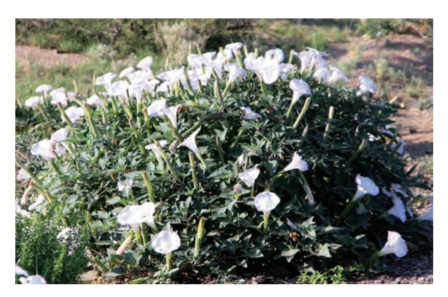
Figure 30B. Sacred datura (Datura inoxia).

livestock and humans occurs from eating any part of the plant, including the seeds. As little as 10–14 oz of the plant, or less than 0.1% of the body weight of the animal, has been proven fatal to cattle. Numerous incidents of human poisoning have resulted from eating the seeds and un-ripened seed pods. For centuries, these plants have been eaten for their hallucinogenic effects.