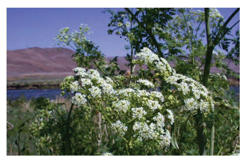
Figure 43. Poison hemlock (Conium maculatum).

DESCRIPTION: Biennial to perennial (on more favorable sites) erect forb 2–10 feet tall; stems are highly branched, hollow, and purplespotted; leaves are 2–4 pinnately compound, deeply cut, and similar to parsley; when crushed, fresh leaves have a strong parsnip odor and nauseating taste; flowers are small, white, and grouped together in umbrella-like clusters.