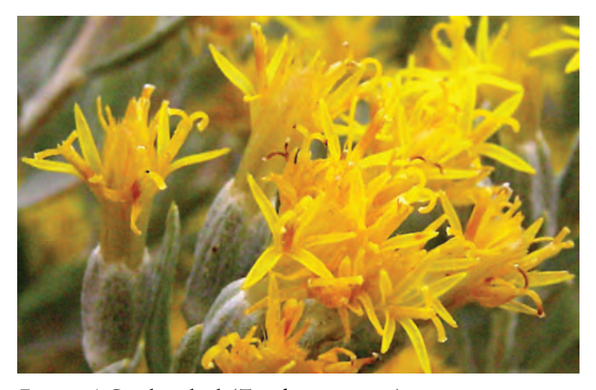
Figure 23A. Gray horsebush (Tetradymia canescens).

Sunflower family (Asteraceae) (Figures 23A and 23B)