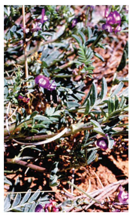
Figure 35E. Red-stemmed peavine (Astragalus emoryanus).

Herbicidal control: Previous work at NMSU has identified effective herbicide control strategies for locoweed, and these recommendations are available in NMSU Extension Guide B-823, Locoweed Control: Aerial Application or Ground Broadcast (http://aces.nmsu.edu/pubs/_b/B823.pdf).