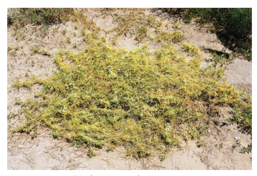
Figure 8B. Knotweed (Polygonum aviculare).

POISONOUS PRINCIPLE AND TOXICITY: While the genus Polygonum is not commonly thought of as a cause of intoxication, they have been implicated in livestock deaths or photosensitization in other countries (United Kingdom, Australia, and Argentina). Photosensitivity is more common.