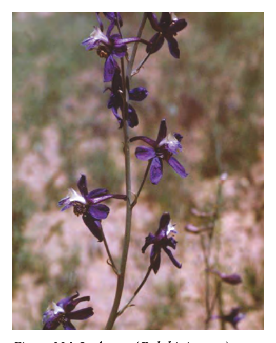
Figure 33A. Larkspur (Delphinium sp.).

Tall larkspurs ( Del-phinium barbeyi , D. glaucum , and others) are large, erect, perennial forbs 3–7 feet tall; stems are straw-colored, darkening near the base, originating from a deep