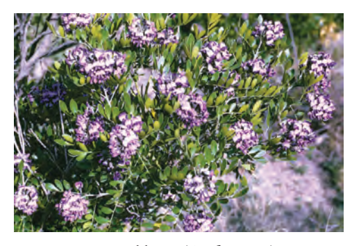
Figure 37. Mescal bean (Sophora sp.).

DESCRIPTION: Shrub that usually grows to about 10 feet tall; leaves are alternate with 7–13 leaflets; flowers are strongly fragrant and light lavender to purple in color; fruit is a large legume pod containing 1–8 bright red, hard-surfaced seeds that are each about 0.5 inch long.