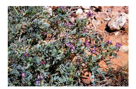
Figure 35F. Red-stemmed peavine (Astragalus emoryanus).