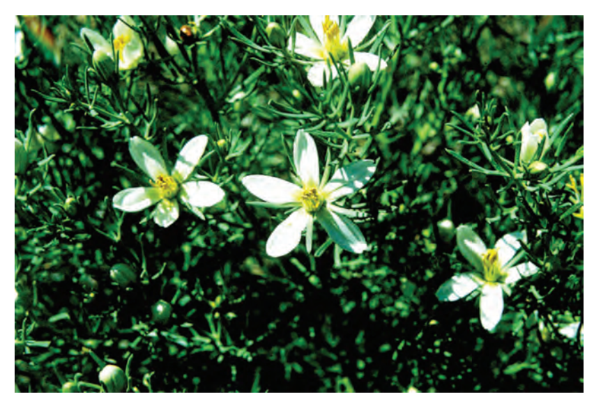
Figure 1A. African rue (Peganum barmala).

Caltrop family (Zygophyllaceae) (Figures 1A and 1B)