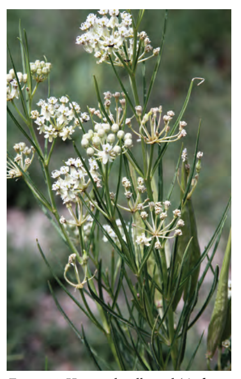
Figure 39. Horsetail milkweed (Asclepias subverticillata).

DESCRIPTION: There are over 100 species of milkweeds in the United States. The two that cause the most poisoning in New Mexico are whorled milkweed and horsetail milkweed. Similar in appearance, these two species can attain heights exceeding 4 feet; leaves are few to many, narrow and linear in shape, and arranged in a whorl around the stem; flowers are usually white or cream-colored with 5 fused petals, and are