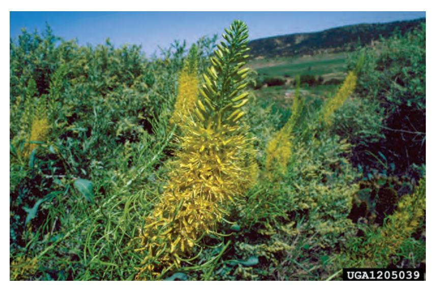
Figure 46. Prince's plume (Stanleya pinnata).

Mustard family (Brassicaceae) (Figure 46)