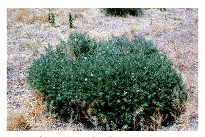
Figure 1B. African rue (Peganum harmala).

contain at least four alkaloids, of which three have the indole configuration. Fruits are the most toxic; a lethal dose is 0.15% of the animal's body weight. Leaves are less toxic, requiring 1.0% of body weight to be lethal.