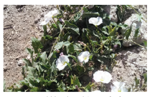
Figure 19. Field bindweed (Convolvulus arvensis).

Perennial, prostrate forb with a tendency to form tangles around other plants or vertical supports, creating a dense mat covered with white or pink flowers; leaves are alternate and arrow-shaped; the root system is extensive, penetrating to depths of 10 feet; fruits are round capsules containing 4 brown seeds, flattened on two sides.