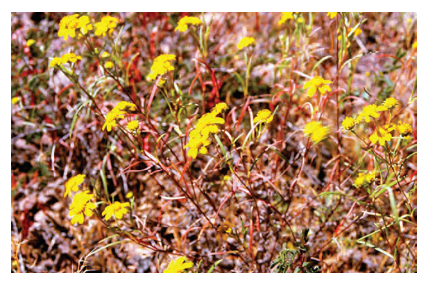
Figure 22A. Annual goldeneye (Viguiera annua).

DESCRIPTION: Erect branching forb 1–2 feet tall; leaves are narrow, opposite, entire, 1–1.5 inches long; plants have yellow sunflower-like heads about 1 inch in diameter.