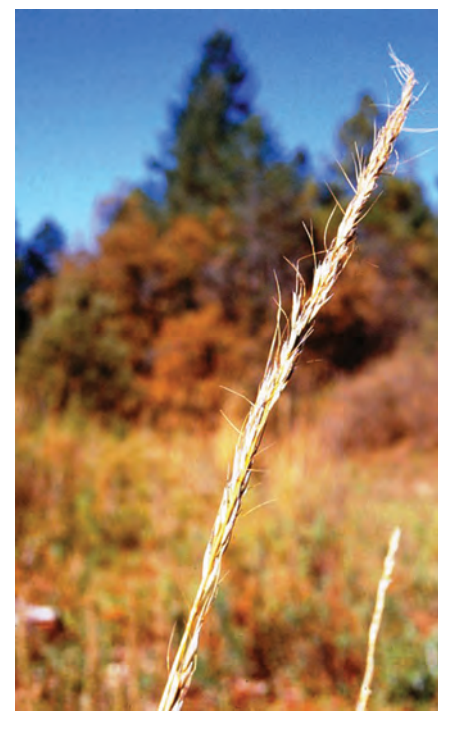
Figure 53A. Sleepy grass (Stipa robusta).

thought to be diacetone alcohol. However, a more likely cause of the problem is toxins produced by endophytic fungi of the Clavicipitaceae family. The endophytes produce high levels of ergonovine and lysergic acid in the plant tissues. Soporific effects may be caused by acetone, a known depressant, released in the digestive tract. The least toxic dose for a horse is 0.6% of the animal's weight; 1% body weight is the average effective single dose.