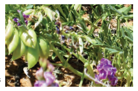
Figure 35D. Half-moon loco or rattle weed (Astragalus allochrous).