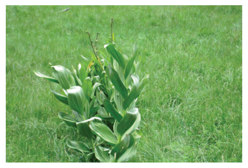
Figure 52. Skunk cabbage (Veratrum californicum).

DESCRIPTION: Large, coarse, erect, perennial forb 2–6 feet tall; stems are stout and hairy, arising from thick, short rootstalks; leaves are broad, prominently veined, 4–12 inches long and 3–8 inches wide; basal leaves are oval, becoming lanceolate above; flowers are numerous, white to greenish, loosely to densely bunched along the main stem.