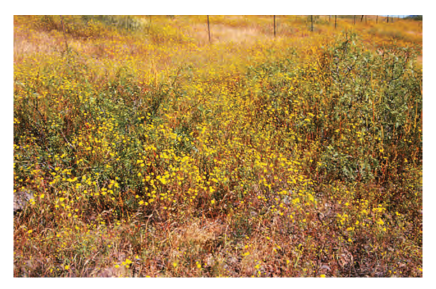
Figure 22B. Annual goldeneye (Viguiera annua).

POISONOUS PRINCIPLE AND TOXICITY: The poisonous principle is unknown, but symptoms suggest prussic acid.