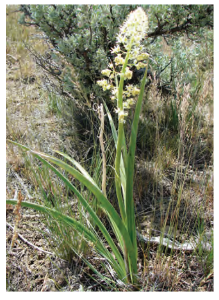
Figure 14. Death camas (Zigadenus sp.).

Death camas are often confused with the nonpoisonous wild onion, but can easily be distinguished by its lack of the characteristic onion odor.