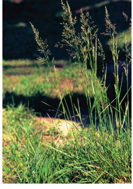
Figure 58. Tall fescue (Festuca arundinacea).

DISTRIBUTION AND HABITAT: Common in irrigated fields statewide; a popular forage plant for cattle and horses.