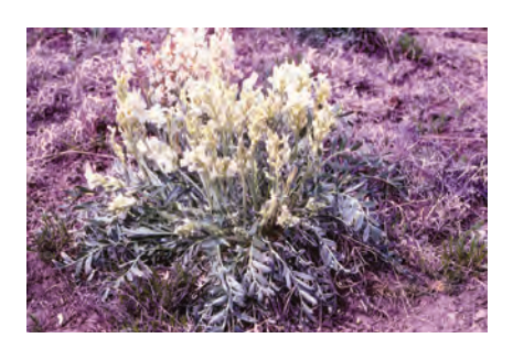
Figure 35B. White point loco (Oxytropis sericea).

Swainsonine, an indolizidine alkaloid, is the toxic principle responsible for the pathological changes observed in body tissues that lead to the disease known as locoism. All parts of the toxic plants (seeds, flowers, foliage, and even pollen) contain some level of swainsonine, and dried plant stems retain sufficient swainsonine content to pose serious health risks even after a year or longer. Among all of the different species and individual varieties of plants in the locoweed category, there is a wide