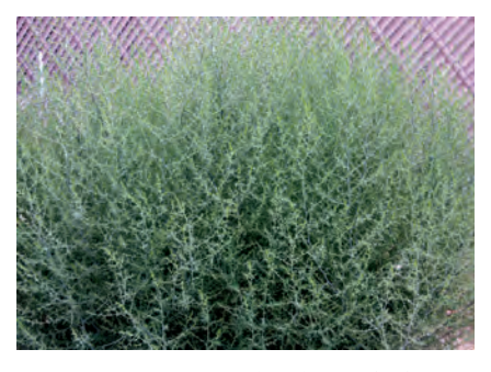
Figure 48. Russian thistle (Salsola sp.).

DESCRIPTION: Also known as tumbleweed; an aggressive, annual forb that was introduced from Eurasia; it consists of many branches and reaches maturity at 2–6 feet in height; at maturity, it