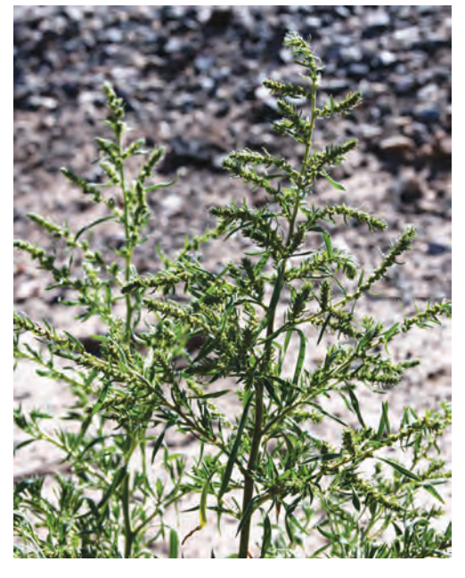
Figure 32. Kochia (Kochia scoparia).

and sheep are the predominant victims of kochia toxicity.