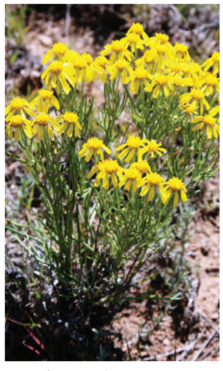
Figure 42. Pingue (Hymenoxys richardsonii).

The toxic principle of pingue has recently been determined to be a series of pseudoguaianolide sesquiterpene lactones. The glandular trichomes on the leaves contain nearly a dozen lactones. The seco-helenanolide, hymenoxyn, is the principal toxin. These lactones are highly irritating to the nose, eyes, and gastrointestinal tract.