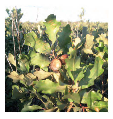
Figure 40A. Shinnery oak (Quercus havardii).

HABITAT: Gambel oak is found throughout the mountainous regions of New Mexico at elevations from 5,000–8,000 feet, often in thickets. Shinnery Oak is found predominantly in the eastern third of New Mexico and is most prevalent in sandy areas.