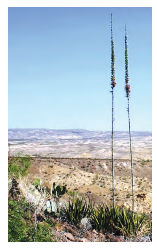
Figure 34B. Lechuguilla (Agave lechuguilla).

Poisoning from lechuguilla can occur any time animals are grazing ranges