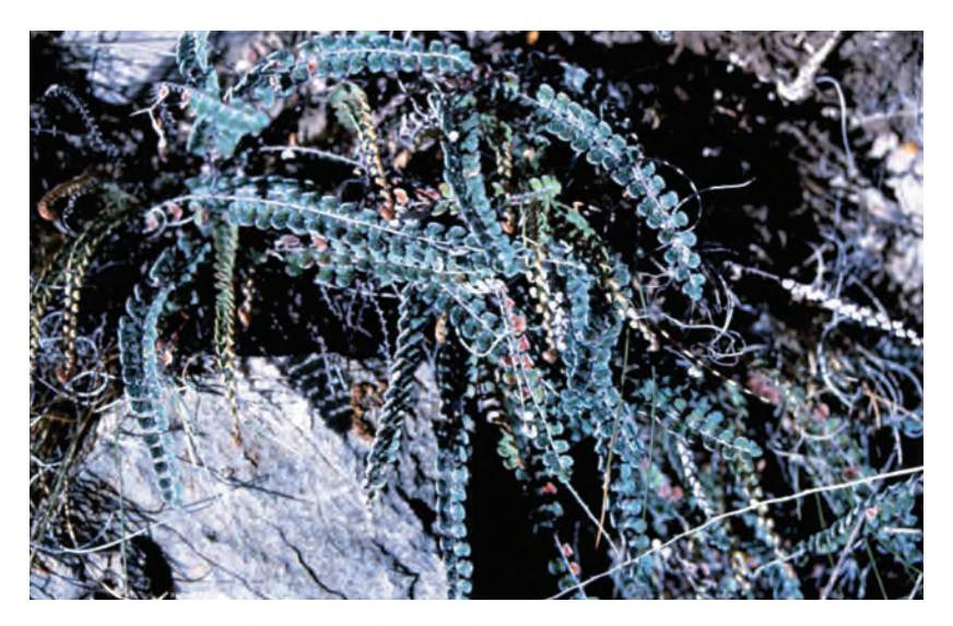
Figure 29. Jimmy fern (Astrolepis cochisensis).

DESCRIPTION: Erect evergreen with simple, fern-like leaves; the numerous leaflets are scaly underneath and have star-shaped hairs above. Jimmy fern is a "resurrection plant": the leaflets roll up and become quite dry during drought, then unroll and appear green and fresh after a rain.