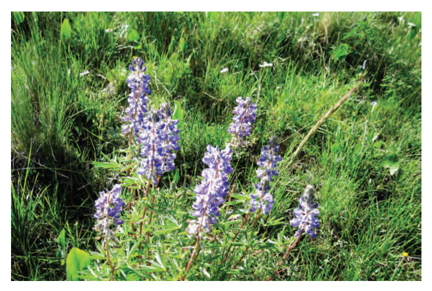
Figure 36B. Lupine (Lupinus sp.).

may result in calves born with marked congenital deformities. This syndrome, known as crooked calf disease, is characterized by malformation of the forelimbs, neck, and back, and in some instances a cleft palate.