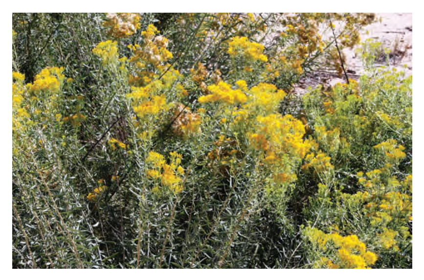
Figure 9C. Rayless goldenrod or Jimmyweed (Isocoma pluriflora).

CONDITIONS OF POISONING: Burroweed and rayless gold-enrod/Jimmyweed are generally low in palatability. Precautions must be taken in winter when snowfall covers better forage plants and burroweed is the only plant available. Native livestock apparently become sickened from eating the plant and tend to avoid it. An adequate supply of good feed during harsh times when livestock are more prone to consume burroweed may reduce its consumption.