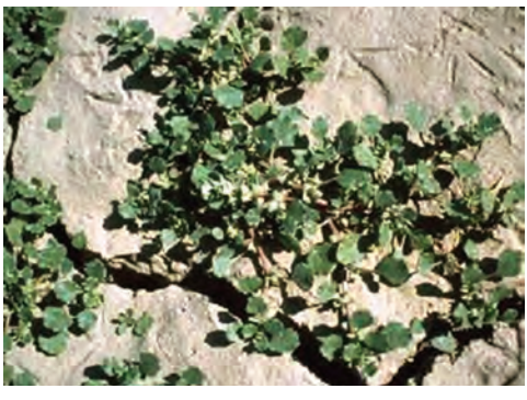
Figure 44. Poison suckleya (Suckleya suckleyana).

DESCRIPTION: Prostrate, succulent annual forb with reddish stems 1–2 feet long; leaves are alternate, triangular or spadeshaped, with dentate margins and long petioles;