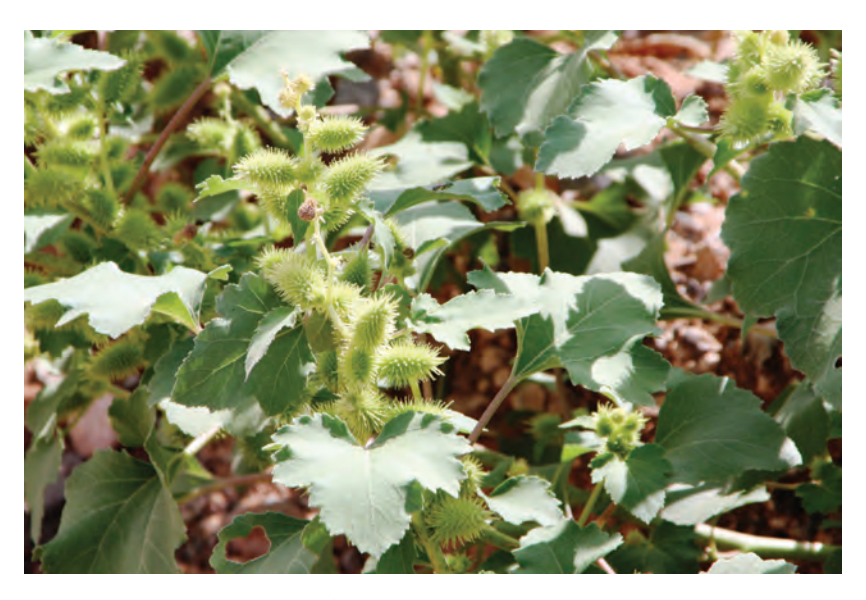
Figure 12. Cocklebur (Xanthium sp.).

Sunflower family (Asteraceae) (Figure 12)