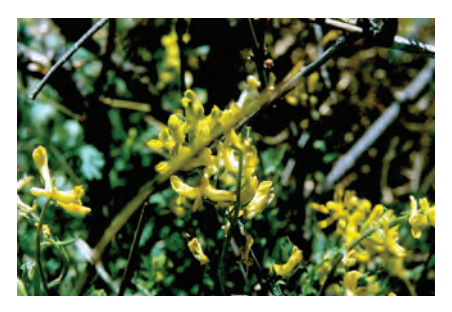
Figure 21. Golden corydalis (Corydalis aurea).

DESCRIPTION: Spreading yellow-flowered annual forb; leaves are 1 or 2 pinnately compound; stems are pale or whitish and leafy; the yellow flowers are irregularly shaped and spurred at the base; flowering occurs from February–May; flowers occur in loose clusters at the branch ends; seeds are black and shiny.