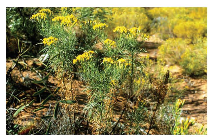
Figure 25B. Riddell's or broom groundsel (Senecio riddellii).

POISONOUS PRINCIPLE AND TOXICITY: Both groundsel species contain pyrrolizidine alkaloids (PA). The specific physiological effect of this toxin group provokes liver lesions. The gradually increasing liver damage leads to hepatic insufficiency and neurologic manifestations over time. Doses of 1–5% of an animal's weight fed at one time or over a few days will bring on acute poisoning. Acute poisoning is not unknown under natural conditions, but is rare. Chronic cases are brought on by smaller daily, but larger total, doses obtained over the course of several weeks or months, both experimentally and under natural conditions. In most cases, the amount consumed by cattle and horses before chronic symptoms begin appears to vary between 12 and 15% of body weight, with symptoms appearing in less than a month or not until after five months. Variation depends in part on species of Senecio, species of animal, and growth stage of the plant. Flowers contain a higher concentration of PA than the vegetative portions of the plant. Cattle and horses are about equally sensitive to the toxic effects. Sheep and goats are more resistant, but have been poisoned experimentally. From 1–4% of an animal's body weight per day of groundsels would provoke symptoms after only a month. Roughly twice as much is required to poison sheep and goats for the same effect as in cattle and horses.