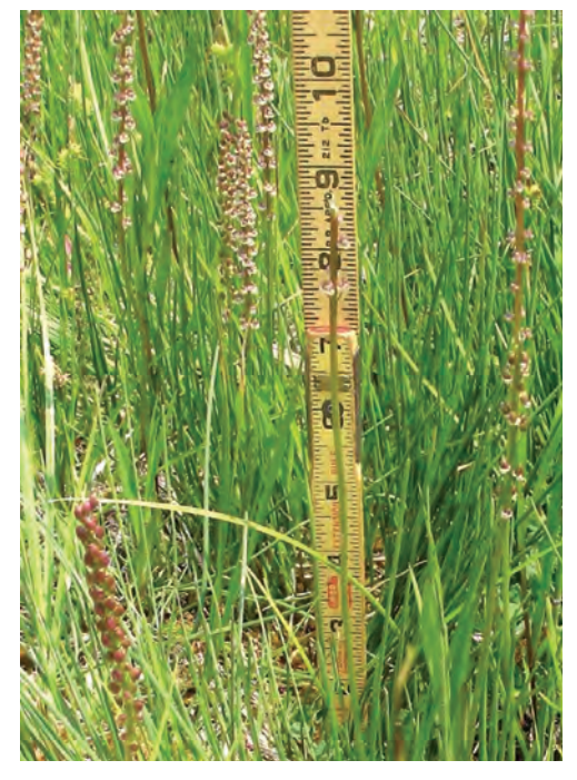
Figure 3. Arrowgrass (Triglochin sp.).

Perennial, unbranched, grass-like plants 1–3 feet tall; leaves are basal, 6–18 inches long, linear, unjointed, somewhat fleshy; flowers are small, 0.125 inch long, greenish, inconspicuous individually, bunched together on the upper portion of the main flowering stem; seedpods are three-seeded, about 0.25 inch long, lobed,