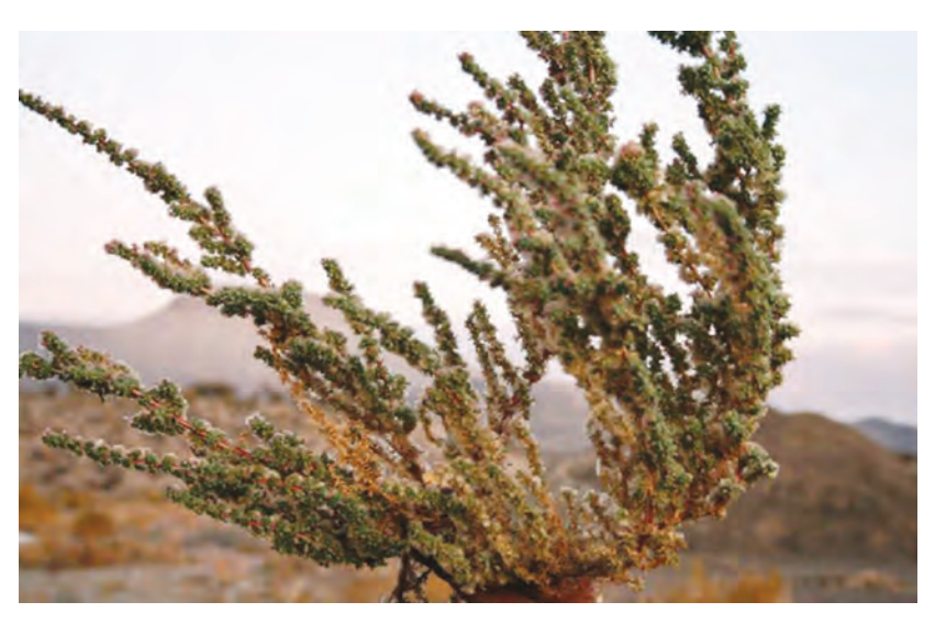
Figure 26A. Halogeton (Halogeton glomeratus).

Goosefoot family (Chenopodiaceae) (Figures 26A and 26B)