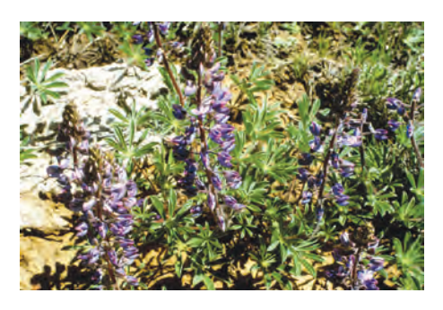
Figure 36A. Lupine (Lupinus sp.).

DESCRIPTION: Perennial forbs 0.5–3 feet tall, originating from a taproot; leaves palmately compound, divided into 5–7 finger-like leaflets; flowers are blue, occasionally white, pink, yellow, or blue-and-white, found in loose clusters around the upper stalks; fruit is a pea-like pod, 2- to 12-seeded.