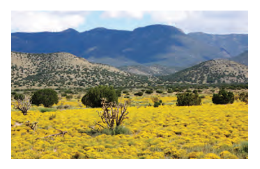
Figure 54C. Broom snakeweed (Gutierrezia sarothrae).

of weight, nasal discharge, fecal mucous, bloody urine, and vaginal discharge. A dry and peeling muzzle with nasal discharge has also been noted in cattle. Postmortem lesions include severe damage to kidneys and liver. The spleen is congested and the intestinal tract is inflamed. The most common sign is a retained placenta.