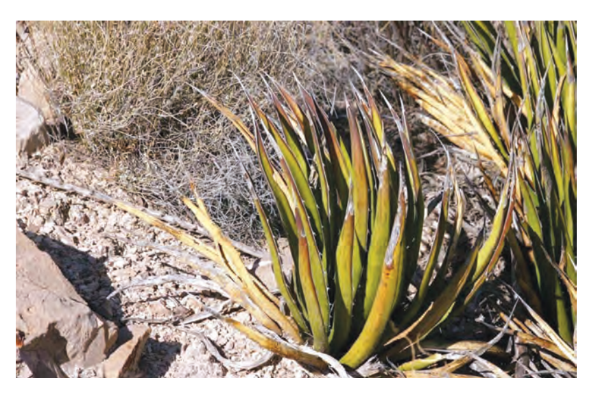
Figure 34A. Lechuguilla (Agave lechuguilla).

Agave subfamily (Agavoideae) (Figures 34A and 34B)