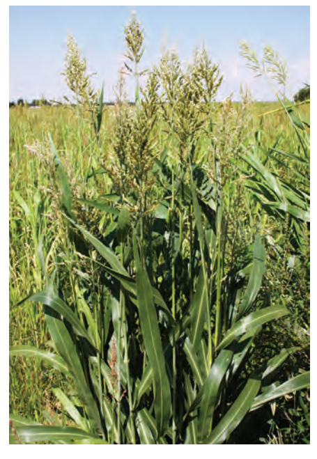
Figure 56. Sorghum (Sorghum bicolor).

Sorghums are generally annuals, although a few perennials are important for livestock forage, especially Sorghum × almum, a non-weedy relative of Johnson grass. Generally speaking, the grass sorghums grown for forage are tall, slender-stemmed, and narrowleaved; these grass sorghums are generally referred to as "Sudan grasses"; notable varieties include 'Hay Grazer', 'Sweet Sudan', and 'Sudax', among others. Grain sorghums include numerous varieties of milo and hegari. Sorgos, plants grown for syrup, and broomcorn sorghums are generally of lesser importance in New Mexico.