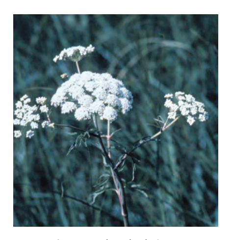
Figure 62. Water hemlock (Cicuta maculata).

Poison hemlock ( Conium maculatum ) is often confused with water hemlock, but while the former is found on moist areas, the latter is usually semi-aquat-