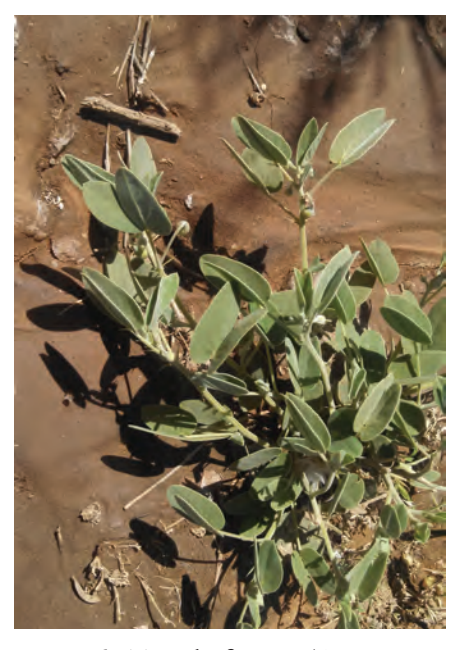
Figure 61. Twin-leaf senna (Senna roemeriana).

Twin-leaf senna contains a series of anthraquinones that exert toxic effects on the digestive tract and skeletal muscles. Other species of Senna have