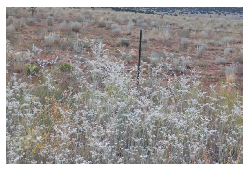
Figure 8A. Wild buckwheat (Polygonum convolvulus).

DESCRIPTION: Perennial or annual forbs or herbaceous vines; stems are prostrate ( P. aviculare ) or erect ( P. convolvulus ), jointed with swollen nodes; leaves are simple and alternate, margins entire; flowers are in racemose or spicate panicles or axillary clusters with 4–6 petaloid sepals; fruit is a shiny black or brown achene.