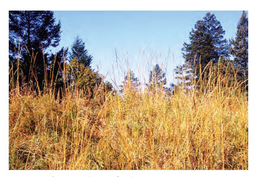
Figure 53B. Sleepy grass (Stipa robusta).

to drag their feet. Horses are sleepy and are difficult to rouse. Heads are droopy, legs are crossed, and horses stagger weakly if moved. Sweating may be profuse, and the narcosis may last for several days in horses and less than 24 hours in cattle and sheep. Death is rare.