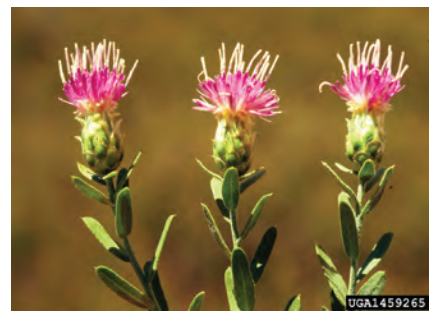
Figure 47. Russian knapweed (Acroptilon repens).

DESCRIPTION: Creeping perennial forb that is erect, stiff, and branched and reaches heights of 1–3 feet; young stems are covered with short gray hair; lower leaves are alternate with toothed margins, upper leaves have entire margins