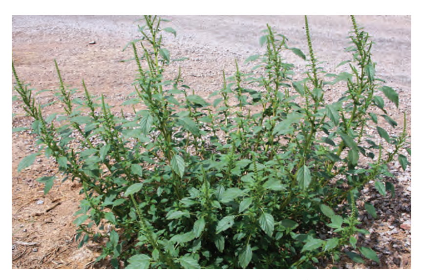
Figure 41. Pigweed or careless weed (Amaranthus retroflexus).

Amaranth family (Amaranthaceae) (Figure 41)