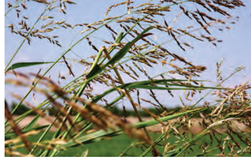
Figure 31. Johnson grass (Sorghum halepense).

Coarse perennial 3–6 feet tall, with scaly root stalks; leaves are broad; the numerous seeds are yellow to purplish and occur in large, many-branched clusters.