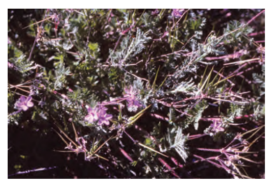
Figure 20. Filaree (Erodium cicutarium).

Introduced, lowgrowing annual forb usually less than 6 inches tall; leaves are somewhat hairy, alternate, and pinnately divided (fernlike); flowers are in clusters on slender stalks arising from leaf axils, lavender in color, blooming from Febru-