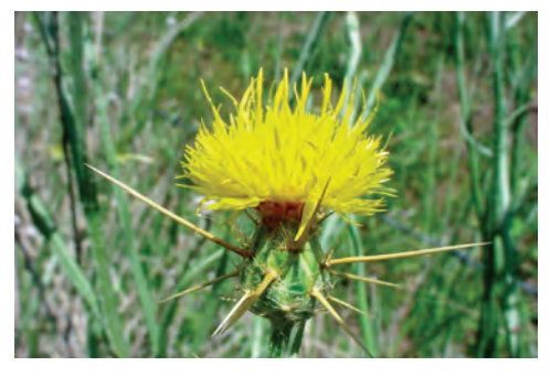
Figure 65. Yellow star-thistle (Centaurea solstitialis).

DESCRIPTION: Annual forb branching from the base to about 1 foot tall; leaves are covered with cottony hairs and the basal leaves are linear and entire; flowers are yellow and showy with bracts that are tipped with stiff, yellow spines 0.5–1 inch long.