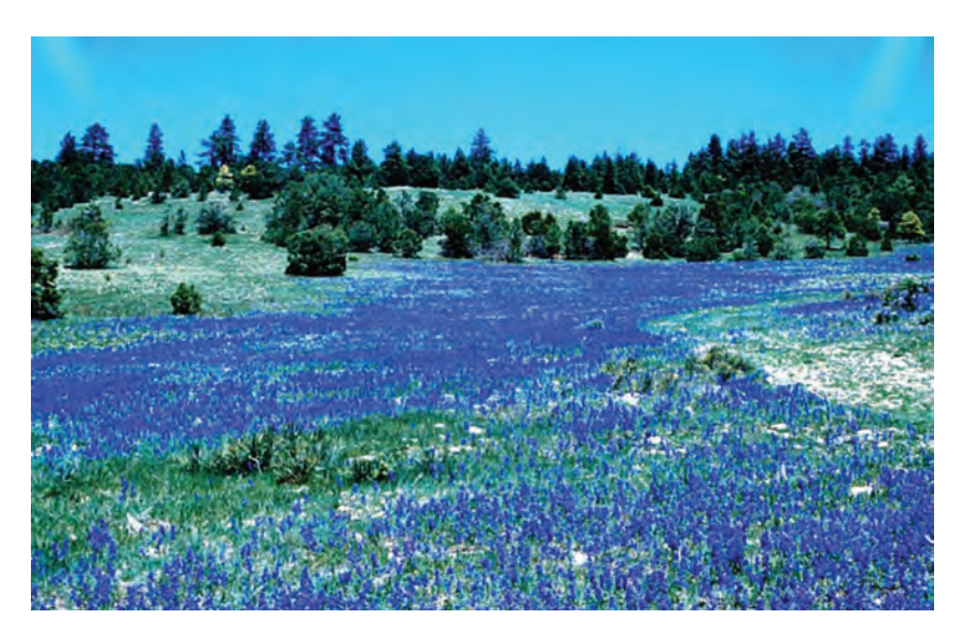
Figure 33B. Larkspur (Delphinium sp.).

hills and mountains, and among underbrush of streams. It is found in valleys and at elevations up to 9,000 feet.