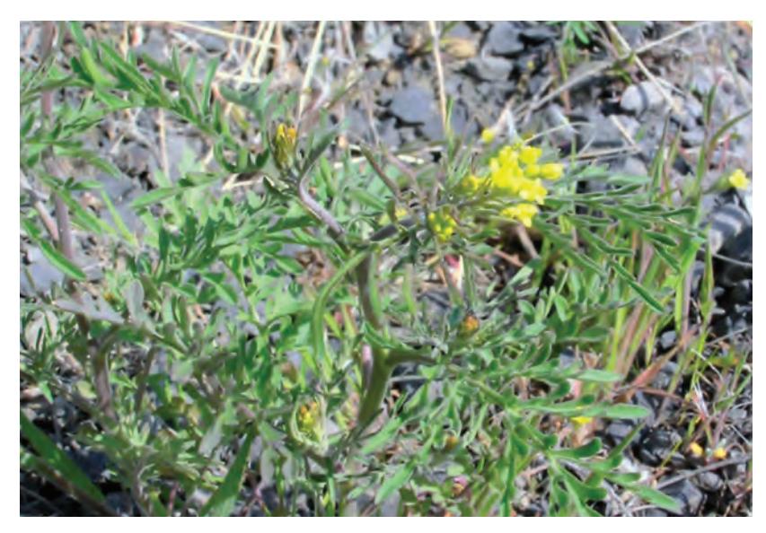
Figure 59A. Tansy mustard (Descurainia pinnata).

Mustard family (Brassicaceae) (Figure 59A)