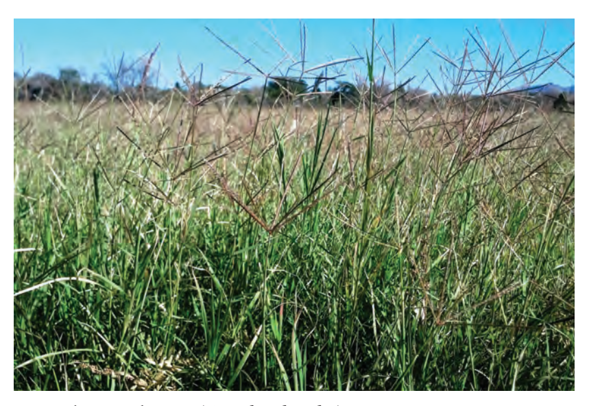
Figure 4. Bermuda grass (Cynodon dactylon).

DESCRIPTION: Introduced perennial sod grass that reproduces by seed, rhizomes, and stolons; internodes are flattened; seedheads have 3–6 purplish spikes in a whorled cluster; plants can form a dense mat.