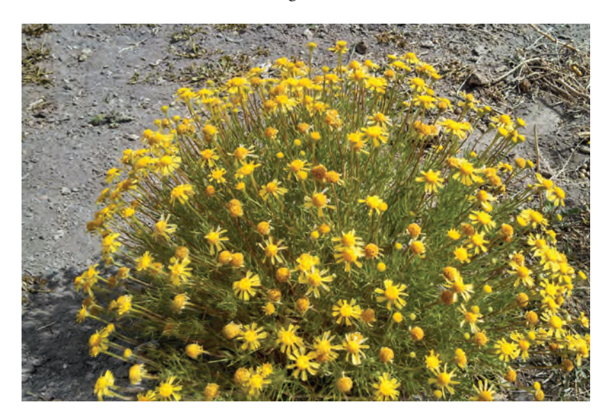
Figure 5. Bitterweed (Hymenoxys odorata).

Sunflower family (Asteraceae) (Figure 5)