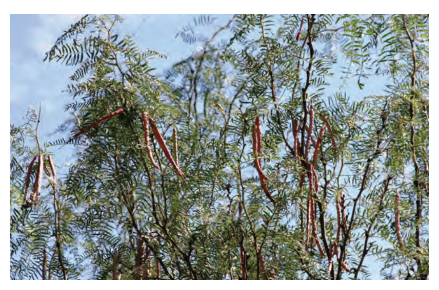
Figure 38. Mesquite (Prosopis glandulosa).

Legume/pea family (Fabaceae) (Figure 38)