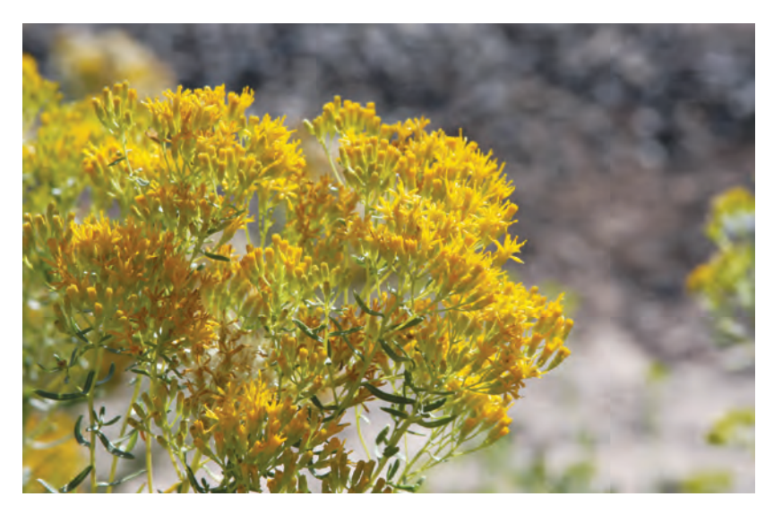
Figure 9B. Rayless goldenrod or Jimmyweed (Isocoma pluriflora).

poisoned dams. In some instances, calves may die from the milk of the poisoned dam before she shows symptoms. The poison can be transmitted to humans through the milk of the cow, causing milk sickness in humans.