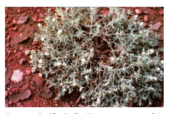
Figure 28C. Alfombrilla (Drymaria arenariodes).

Symptoms appear 12–24 hours after ingesting a toxic dose. The period between the onset of symptoms and death is brief (can be less than 2 hours) and characteristic of Drymaria spp. poisoning. In cattle, symptoms include loss of appetite, diar-