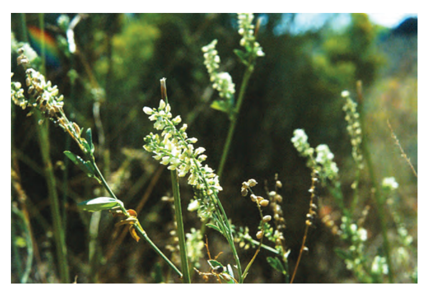
Figure 57. White sweet clover (Melilotus alba).

DESCRIPTION: Annual or biennial forbs that are highly branched and 2–6 feet tall; stems are robust, erect, and sparsely hairy; leaves are divided into three finely toothed ovoid leaflets; flowers are white or yellow, about 0.25 inch long, pea-like, borne in slender clusters arising from the axils of the leaves; fruit is an egg-shaped pod, one- (usually) to four-seeded.