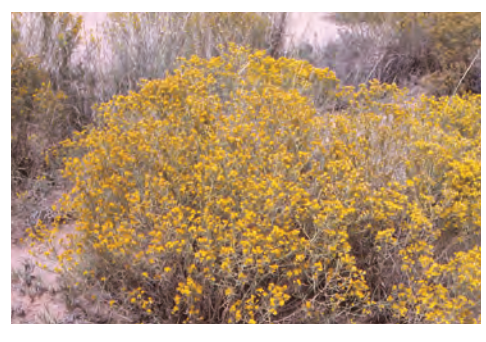
Figure 54B. Broom snakeweed (Gutierrezia sarothrae).