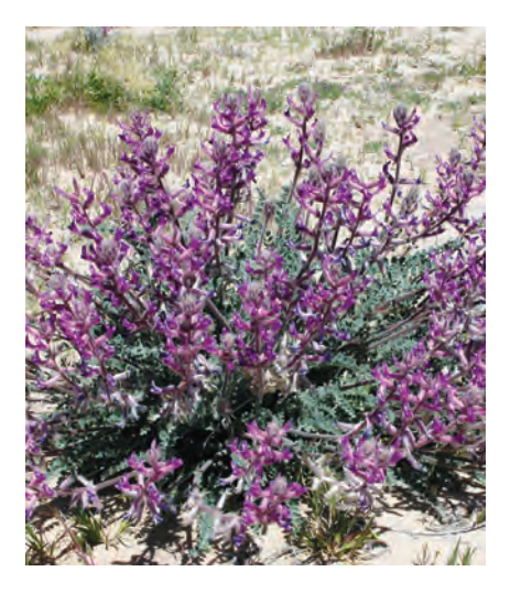
Figure 35C. Wooly loco (Astragalus mollissimus).