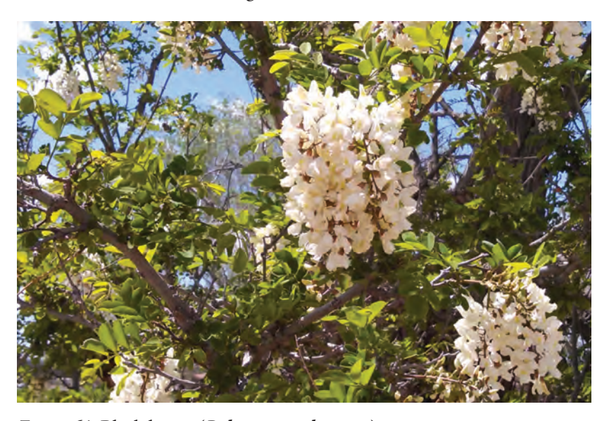
Figure 6A. Black locust (Robinia pseudoacacia).

Legume/pea family (Fabaceae) (Figures 6A and 6B)