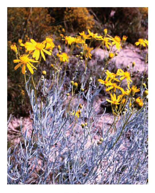
Figure 25A. Threadleaf or wooly groundsel (Senecio flaccidus).

Riddell's groundsel is a bright green herbaceous perennial approximately 1.5 feet tall; stems are smooth and leafy above; leaves are thread-like; the