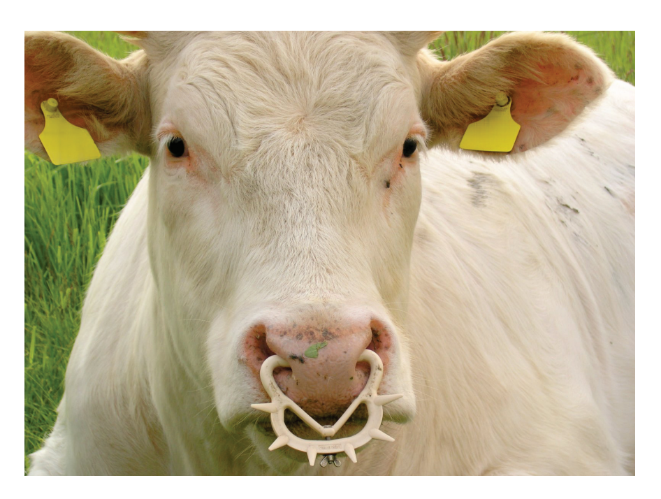
Figure 1. An example of a calf with an anti-suckling device in place during stage one (prohibited from suckling but not separated from dam) of the two-stage weaning process.

New Mexico State University aces.nmsu.edu