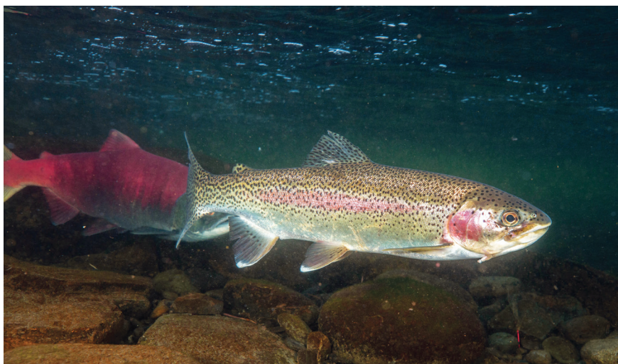
Figure 1. Rainbow trout ( Onchorhynchus mykiss ). Photo by Ryan Hagerty, 2019.

New Mexico State University aces.nmsu.edu