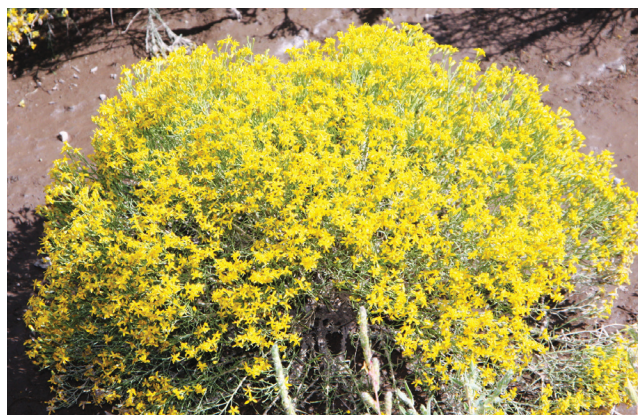
Figure 2. Broom snakeweed ( Gutierrezia sarothrae ).

Foliar sprays will control snakeweed present on the area being treated and will reduce the number of plants that may subsequently re-invade from seed. The treatment life of herbicides varies, but the possibility of long-term snakeweed eradication with a single application is remote, especially where a population is