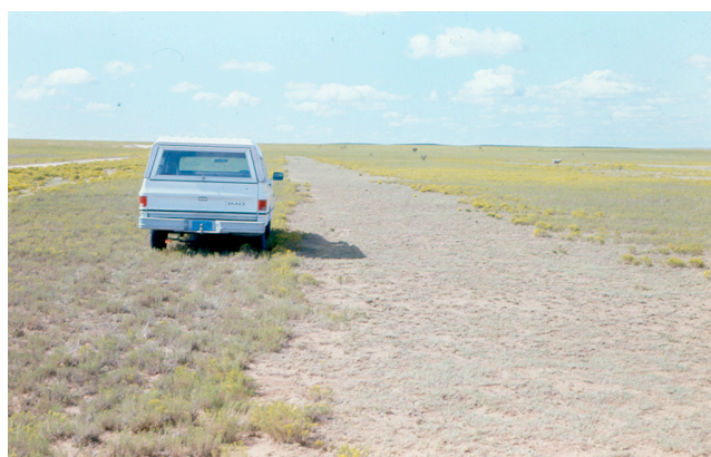
Figure 3. Broom snakeweed can be controlled with foliar herbicides.

extremely dense before treatment. It may take two or more applications over a 5- to 10-year span to achieve the long-term goal of suppressing snakeweed.