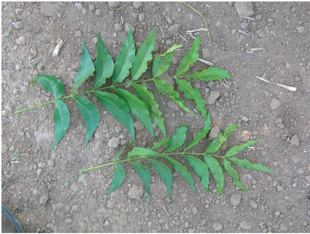
Figure 3. Pecan leaves showing rippled leaf margins characteristic of zinc deficiency.