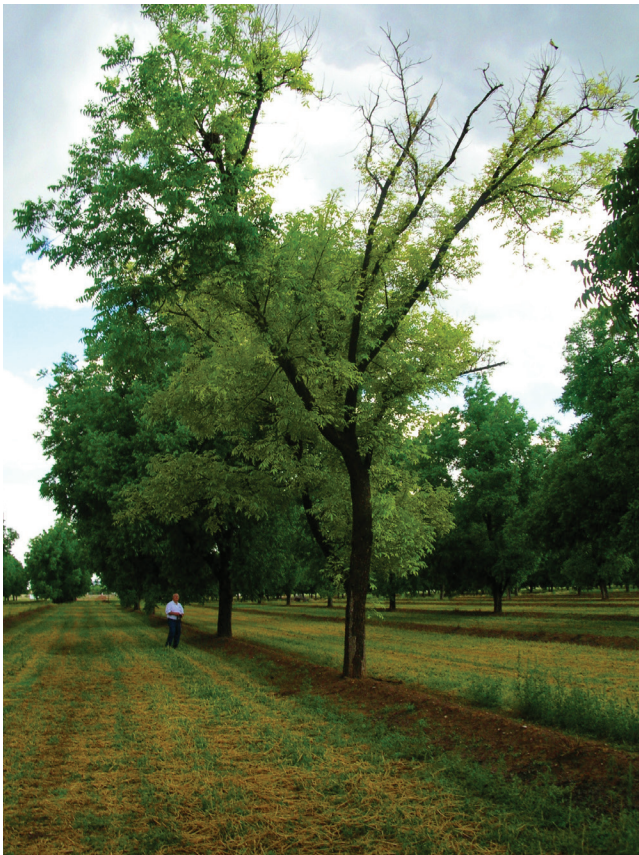
Figure 5. Pecan tree that has experienced branch and limb dieback due to iron deficiency.