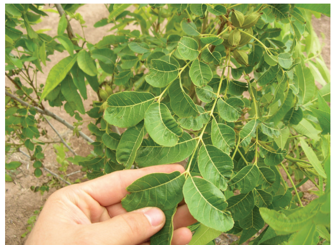
Figure 7. Pecan leaf with rounded "mouse-eared" leaflets, a symptom of nickel deficiency.