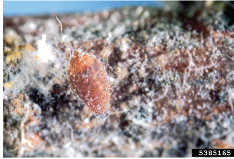
Figure 9C. Woolly apple aphid (Eriosoma lanigerum).