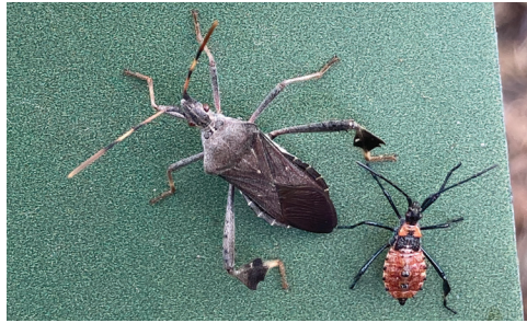
Figure 4A. Immature (nymph, right) and adult leaf-footed plant bugs.