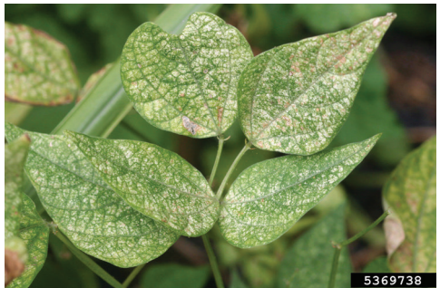
Figure 12B. Leaf damage caused by two-spotted spider mites.