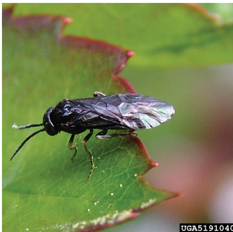
Figure 15B. Adult pear sawfly.

Note: Bt is not a management option for pear slugs since they are sawfly larvae (Hymenoptera) and not caterpillars (Lepidoptera).