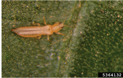
Figure 8. Adult western flower thrip.