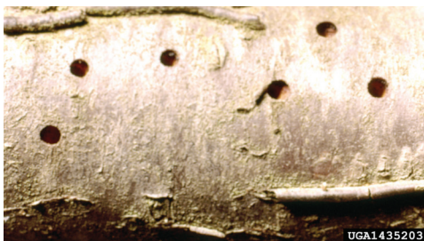
Figure 16A. Shothole borer damage (photo by Clemson University–USDA Cooperative Extension Slide Series, Bugwood.org).