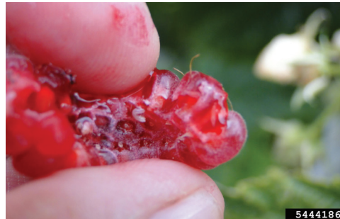
Figure 6B. Spotted wing drosophila larvae (photo by Hannah Burrack, North Carolina State University, Bugwood.org).