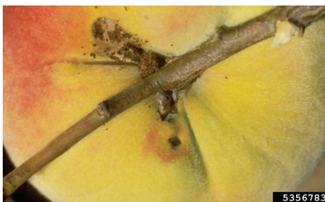
Figure 5B. Peach twig borer damage and frass on fruit.