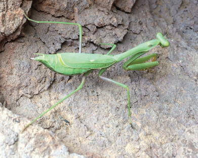
Figure 20B. Praying mantids eat a variety of insects.