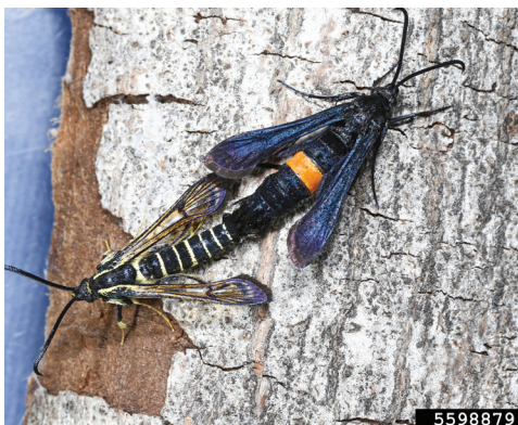
Figure 14B. Male and female peachtree borer moths (female on right) (photo by Joseph Berger, Bugwood.org).