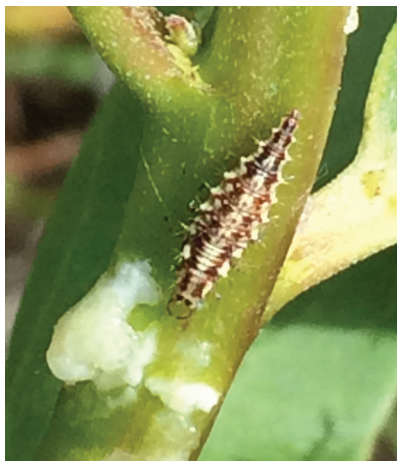
Figure 18B. Lacewing larvae consume soft-bodied insects and insect eggs.