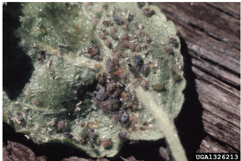
Figure 9B. Rosy apple aphid ( Dysaphis piantaginea ).