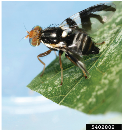
Figure 1B. Apple maggot adult.