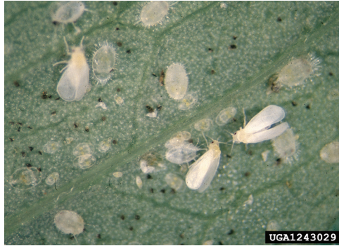
Figure 13. Multiple life stages of greenhouse whitefly.