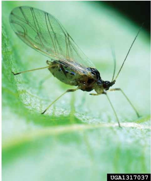
Figure 9A. Green peach aphid ( Myzus persicae ).