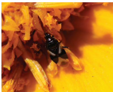
Figure 17. Minute pirate bugs are predators of insect eggs and many soft-bodied insects.

Natural enemies can help suppress pest populations. To help conserve and increase natural enemies, add floral resources to the landscape and make sure pollen and nectar are available throughout the growing season. Figures 17–23 show examples of natural enemies that are commonly found in New Mexico.