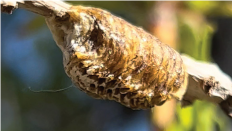
Figure 20A. Praying mantids overwinter in their egg case (ootheca, shown here).