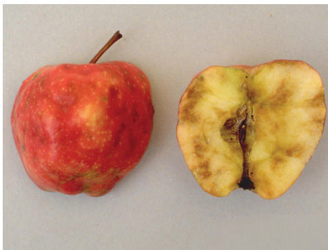
Figure 1C. Apple maggot damage.