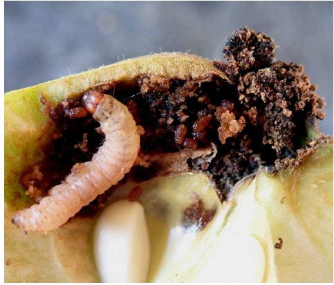
Figure 2B. Damage from late-stage codling moth larva.