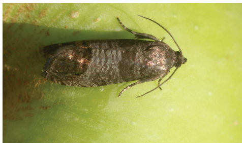
Figure 2A. Codling moth adult.