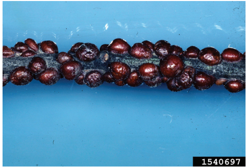
Figure 10. European fruit lecanium (photo by Lacy L. Hyche, Auburn University, Bugwood.org).

Note: Dormant oils will also harm beneficial insects if there is direct contact, so please look closely before you spray.