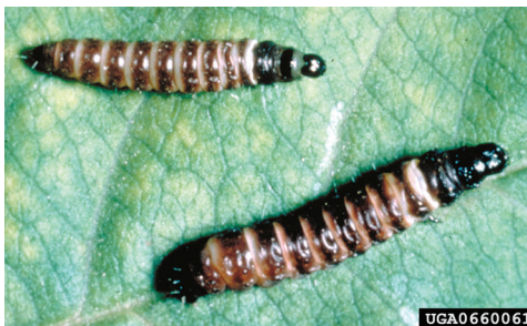
Figure 5A. Peach twig borer larvae (photo by H. Audemard, INRA, Montfavet, Bugwood.org).