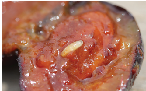
Figure 1A. Apple maggot larva in a plum.