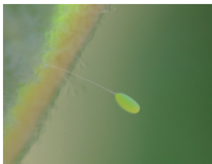
Figure 18A. Lacewing eggs are laid on a stalk and are often found near their insect prey.