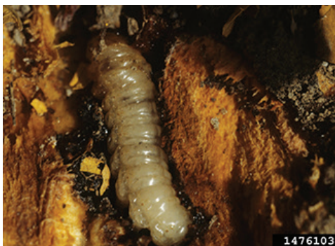
Figure 14A. Peachtree borer larva found inside a peach tree ( Prunus persica ) (photo by Whitney Cranshaw, Colorado State University, Bugwood.org).