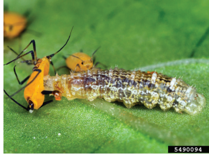
Figure 21. Syrphid fly larvae feed on soft-bodied insects, such as aphids.