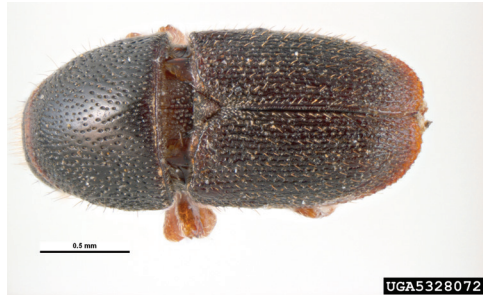
Figure 16B. Shothole borer.