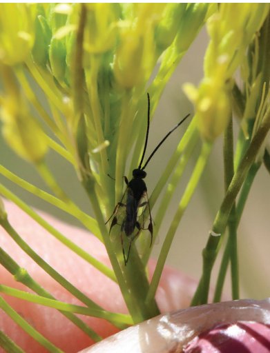
Figure 22. Parasitoid wasps infect the egg, larval, or pupal stage of their insect hosts.