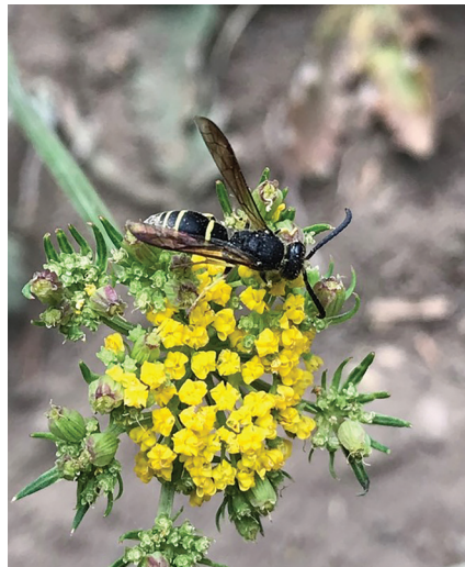
Figure 23. Wasps are carnivorous, but will supplement their diet with nectar.