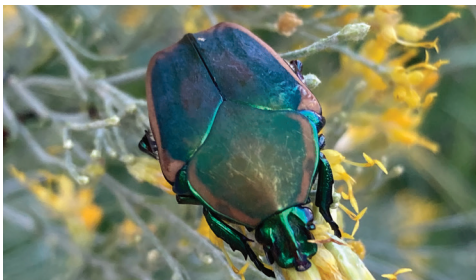
Figure 3A. Green fruit beetles feed on pollen in addition to ripe fruits.