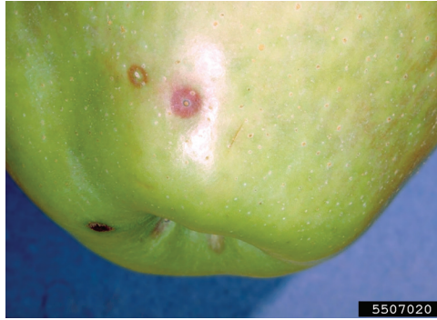
Figure 11. San Jose scale on apple.

For more information on monitoring and treating San Jose scale with insecticides, see NMSU Extension Guide H-428, San Jose Scale, (Quadraspidiotus perniciosus) and Its Control ( https://pubs.nmsu.edu/_h/H428.pdf ).