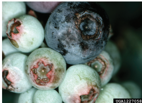
Figure 4B. Example of feeding damage from leaf-footed plant bugs on blueberry (photo by Jerry A. Payne, USDA Agricultural Research Service, Bugwood.org).