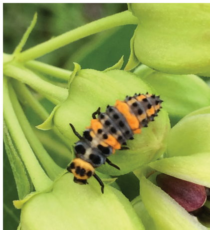
Figure 19. Lady beetle larvae (shown here) and adults are predators of many insect pests.