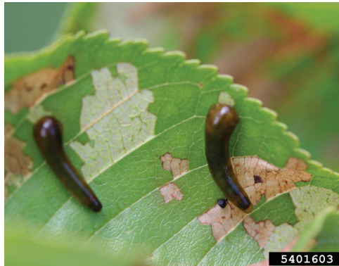
Figure 15A. Pear slugs on a leaf.