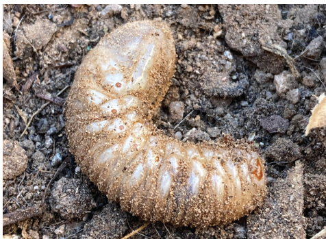
Figure 3B. Grubs live in the soil and can be found in compost piles.