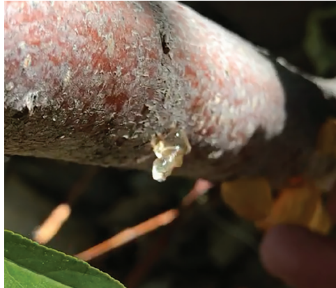
Figure 14C. Gummosis found along the trunk of Prunus sp. (photo by Marisa Thompson, NMSU).

Pear slugs (aka cherry slugs, Caliroa cerasi , Figures 15A and 15B)