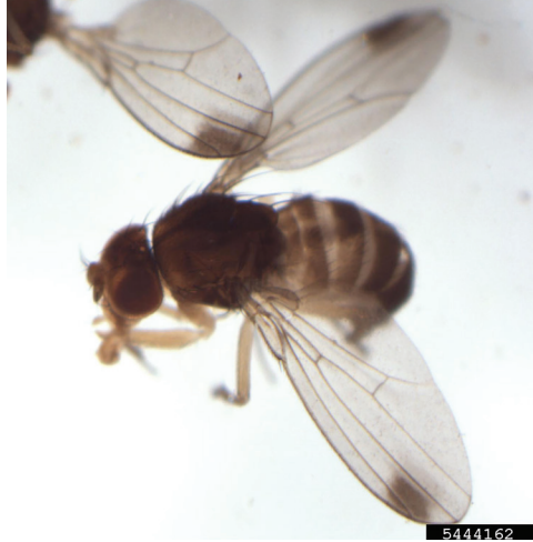
Figure 6A. Male spotted wing drosophila.

Note: Other Drosophila species feed on overripe or damaged fruit in New Mexico, so it is important to identify which species you have found.